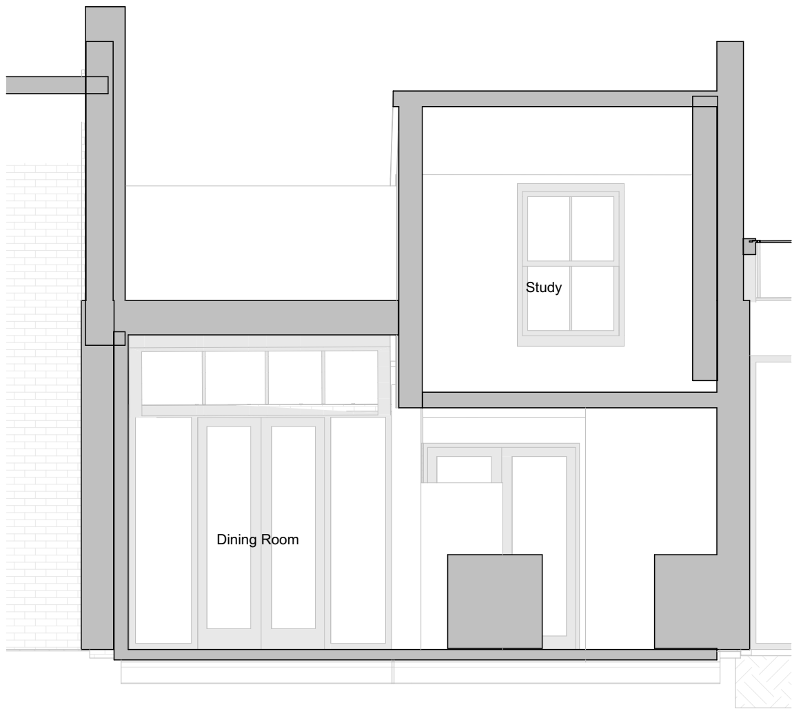
05 Proposed Section B 1:50