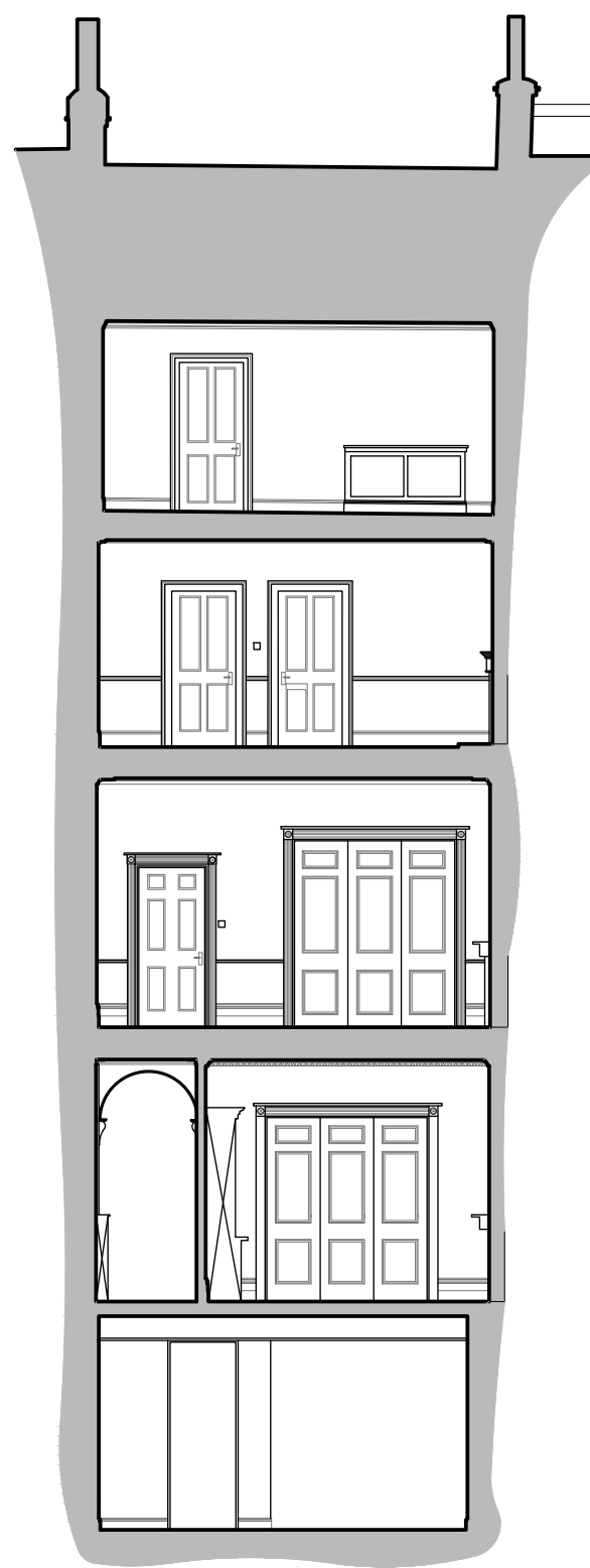
03 Section C-C - As Existing 1103 1:100 @ A3