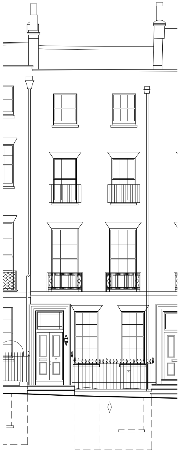
01 External Front Elevation - As Existing 1103 1:100 @ A3