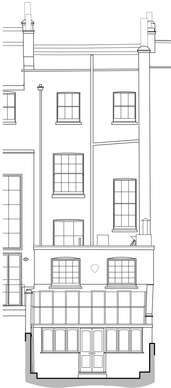
02 External Rear Elevation - As Existing 1103 1:100 @ A3