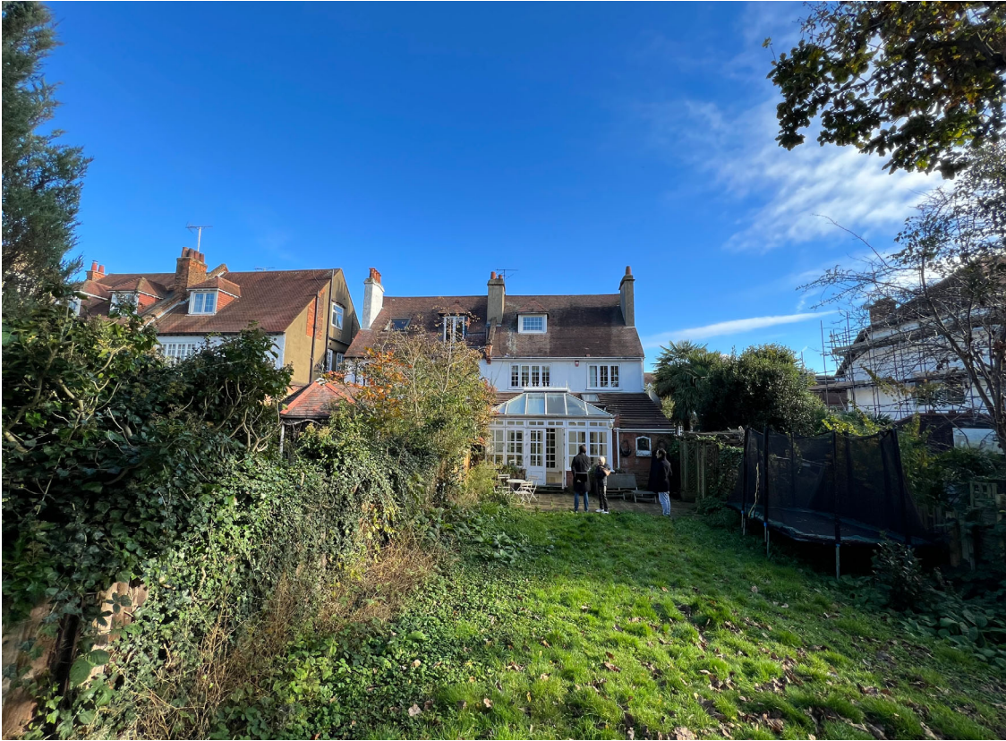
Rear Elevation (West Elevation)