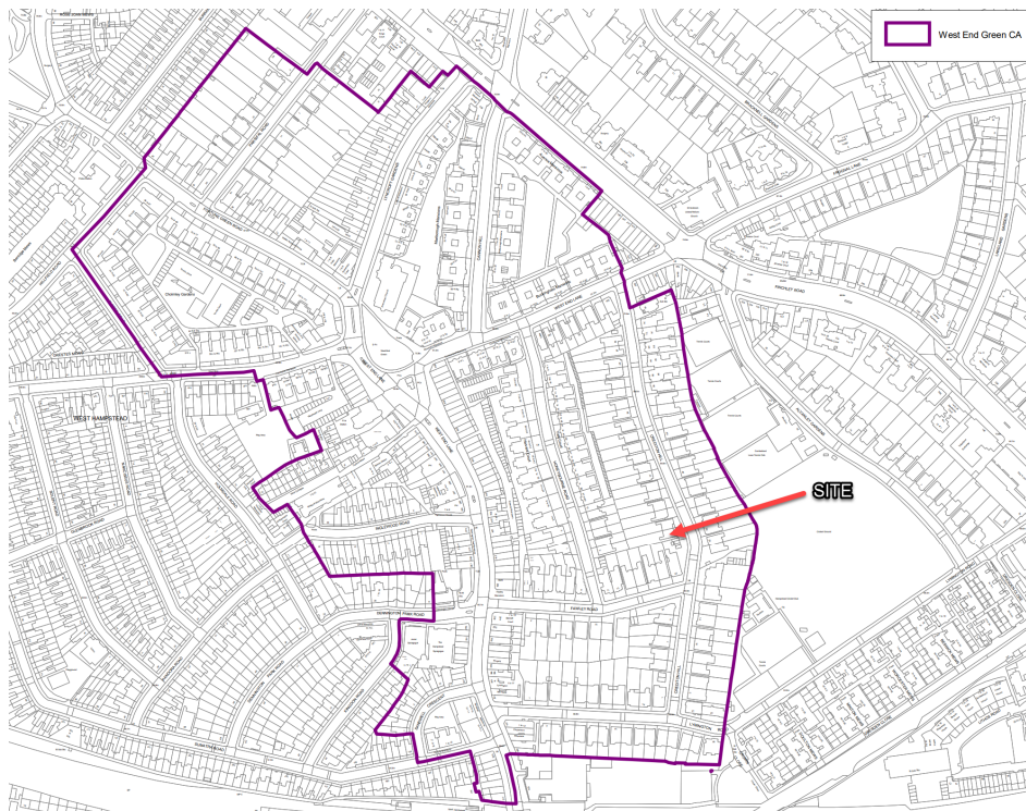
Figure 2 – Map of West End Green Conservation Area

The application site is located within the West End Green Conservation Area but is not a statutorily Listed Building (NB. the nearest Listed Building is the Grade II* listed Hampstead Synagogue located approx. 215m south-west of the site). The site is also not a Locally Listed Building.