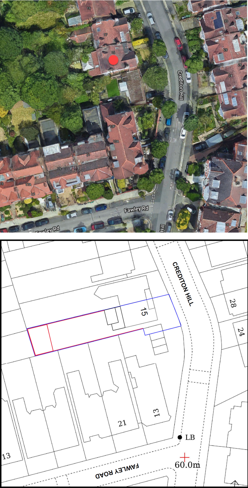
Figure 1 – Site Location, Aerial Views, and Site Photos