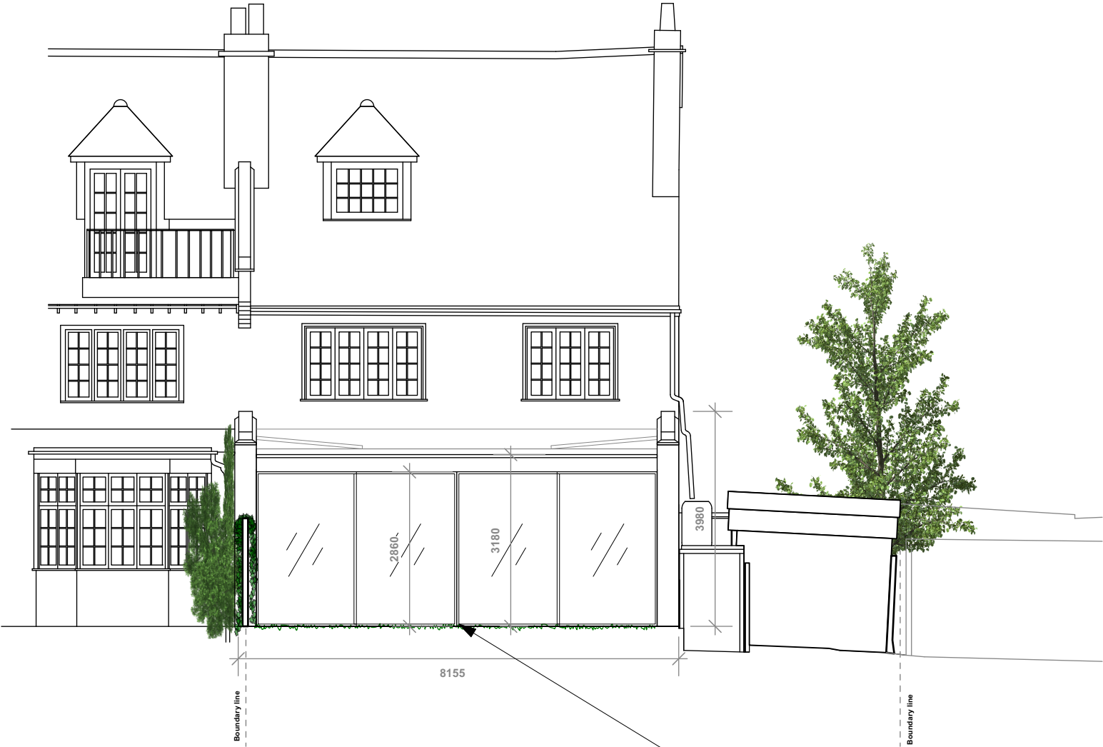
Proposed Western Elevation