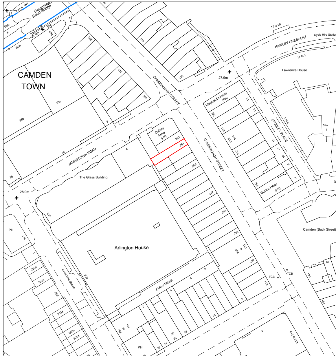
EXISTING LOCATION PLAN SCALE 1:1250

NOTES ORIGINAL A3 DO NOT SCALE FROM THIS DRAWING. (DRAWING MAY BE SCALED FOR LOCAL AUTHORITY & PLANNING PURPOSES ONLY) ALL DIMENSIONS TO BE CHECKED ON SITE . COPYRIGHT PROTECTED.