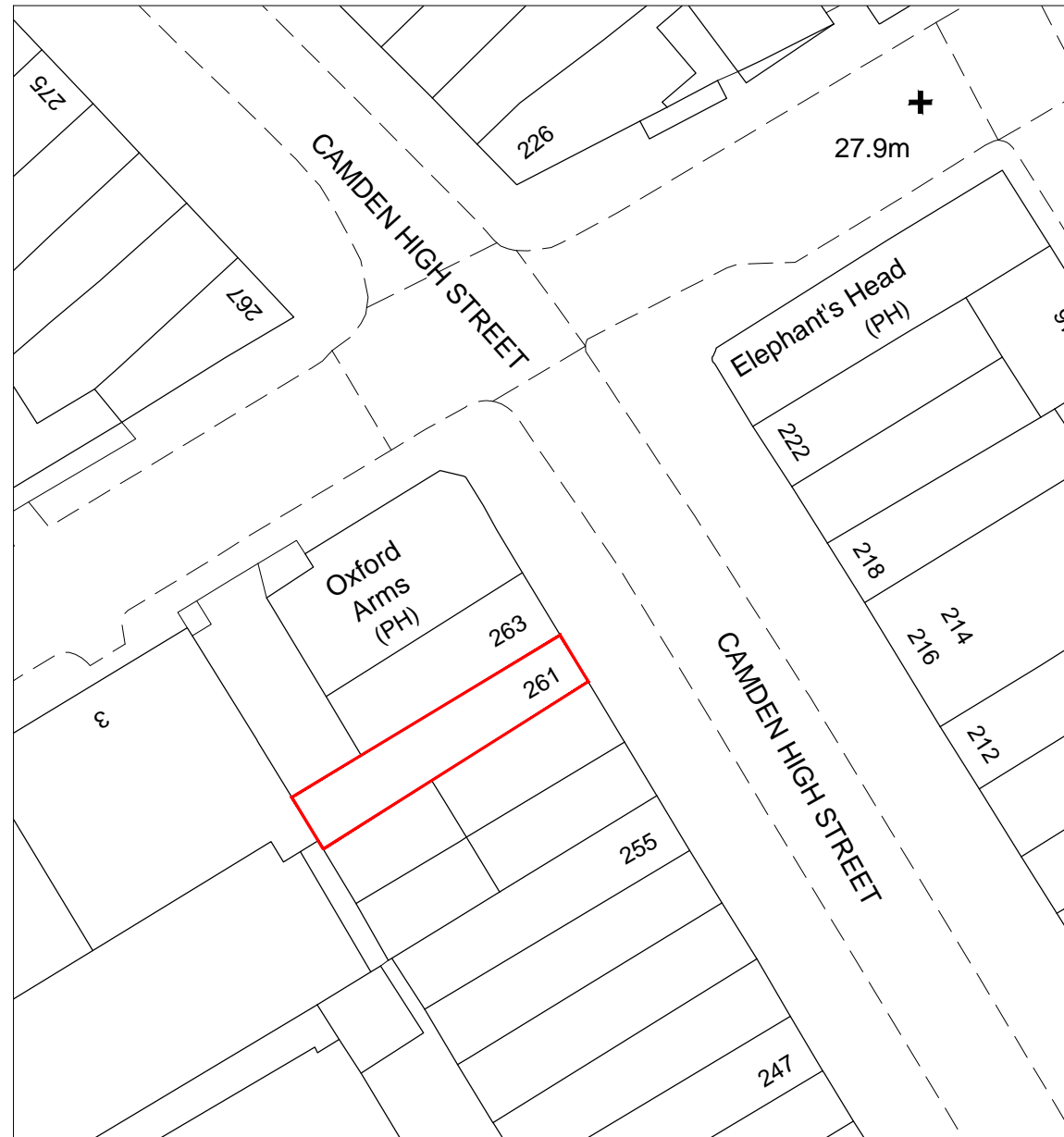
EXISTING BLOCK PLAN SCALE 1:500