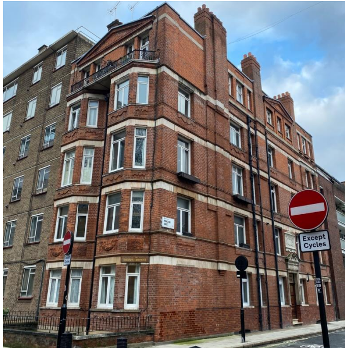
Kingsway Mansions, 23A Red Lion Square, WC1R 4SE