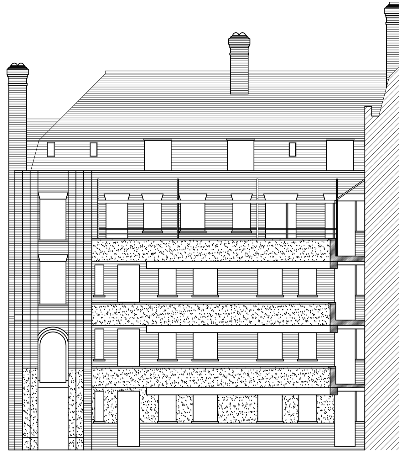
ELEVATION A - AS EXISTING

NOTES: Report all discrepancies, errors and omissions Do not scale from this drawing. Verify all dimensions on site before commencing any work or preparing shop drawings. All materials, components and workmanship are to comply with all the relevant British Standards, Codes of Practice, and appropriate manufacturers recommendations that from time to time shall apply. For all specialist work, see relevant drawings. This drawing and design are copyright of PELLINGS LLP