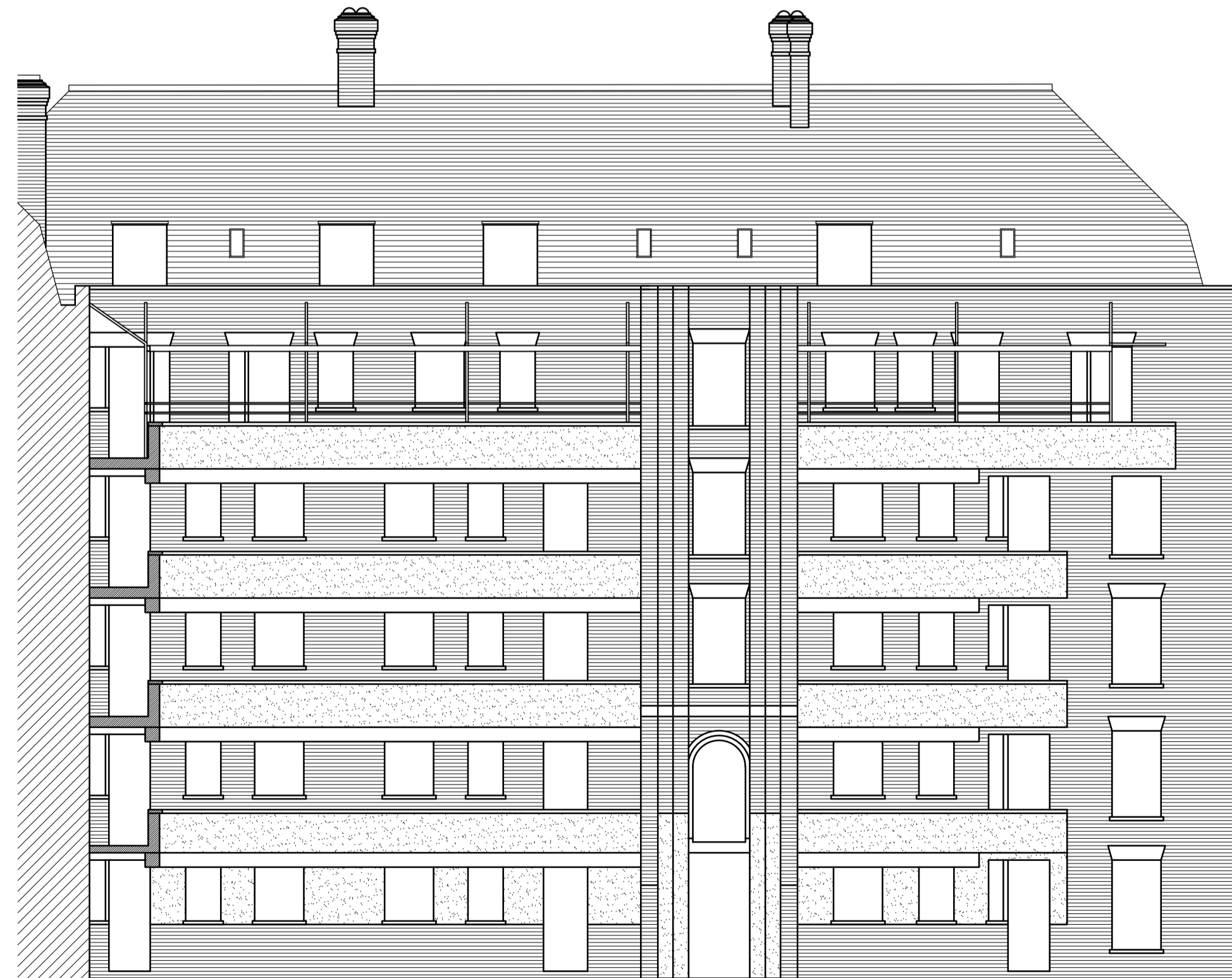
ELEVATION C - AS EXISTING