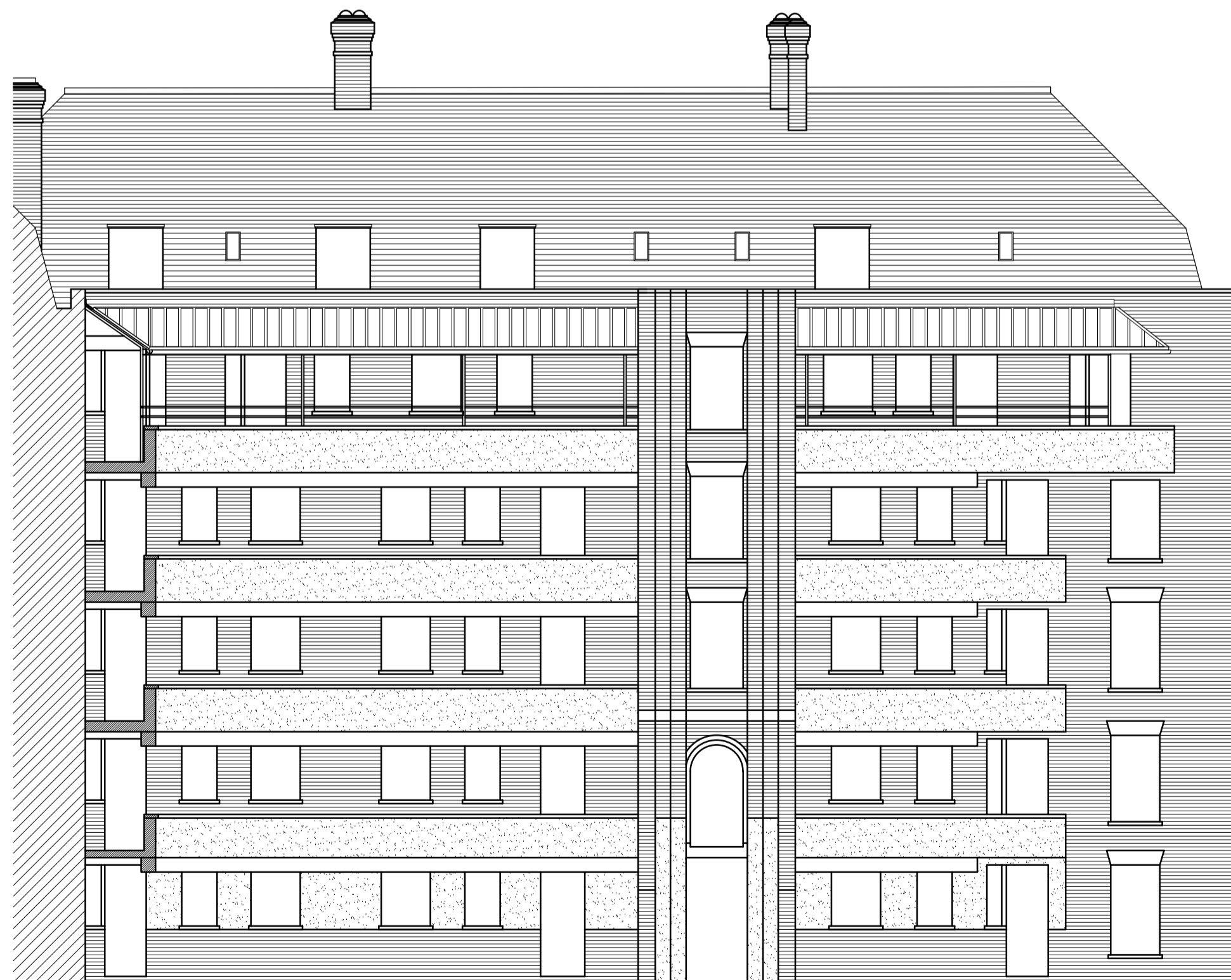
ELEVATION C - AS PROPOSED