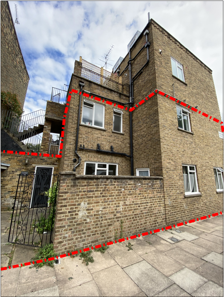
Existing rear of property