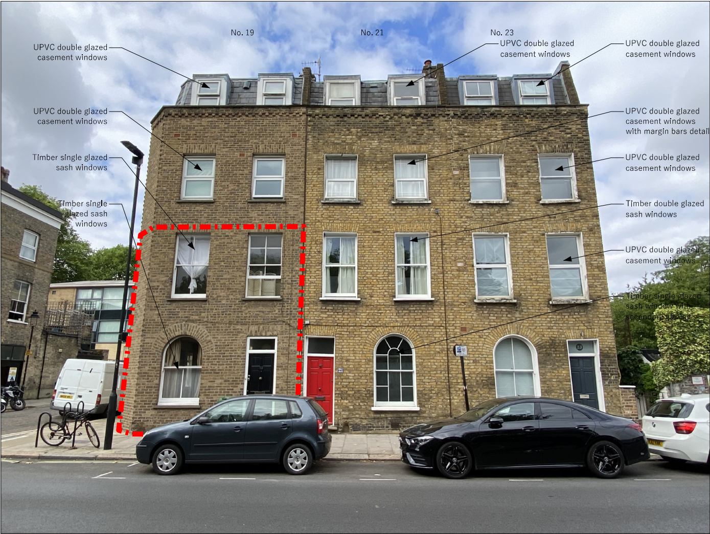
Existing front of property