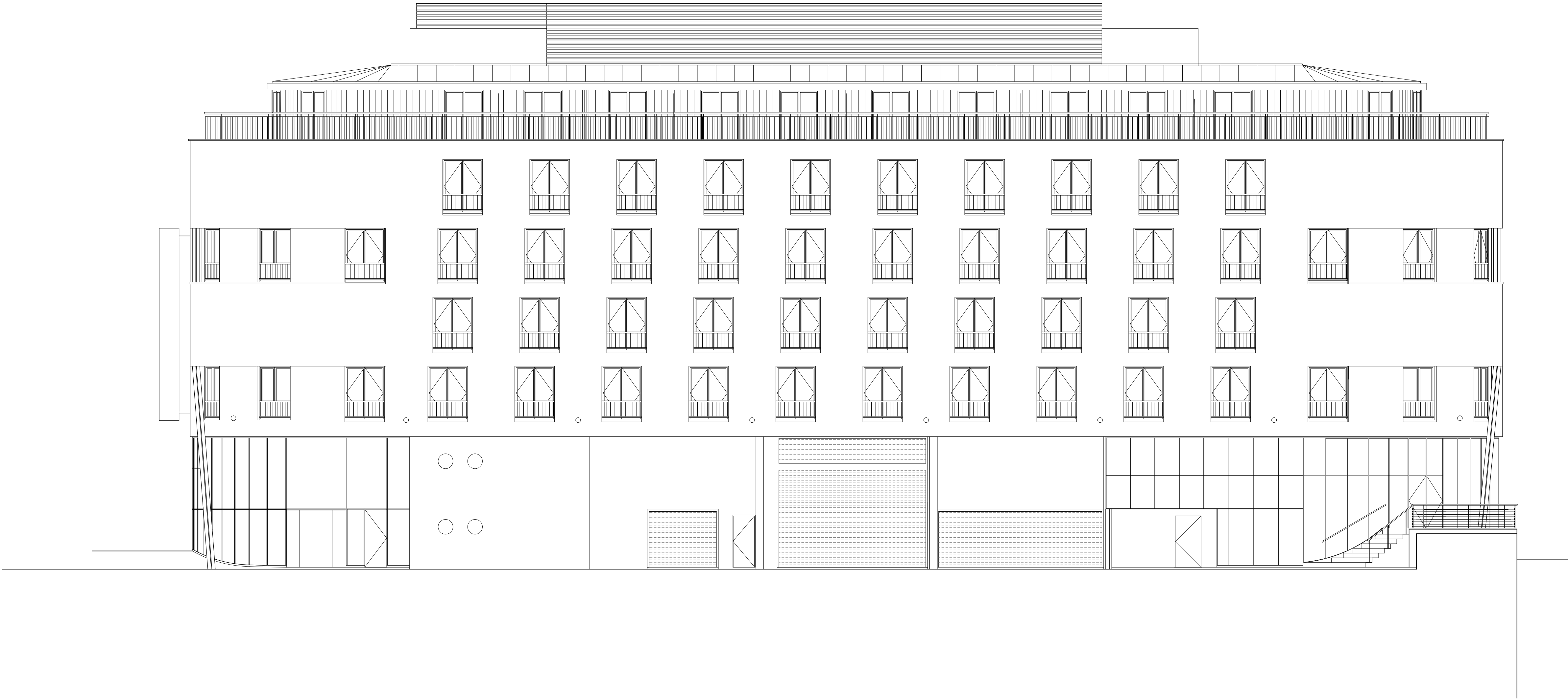
Proposed East Elevation Scale 1:100 @A1