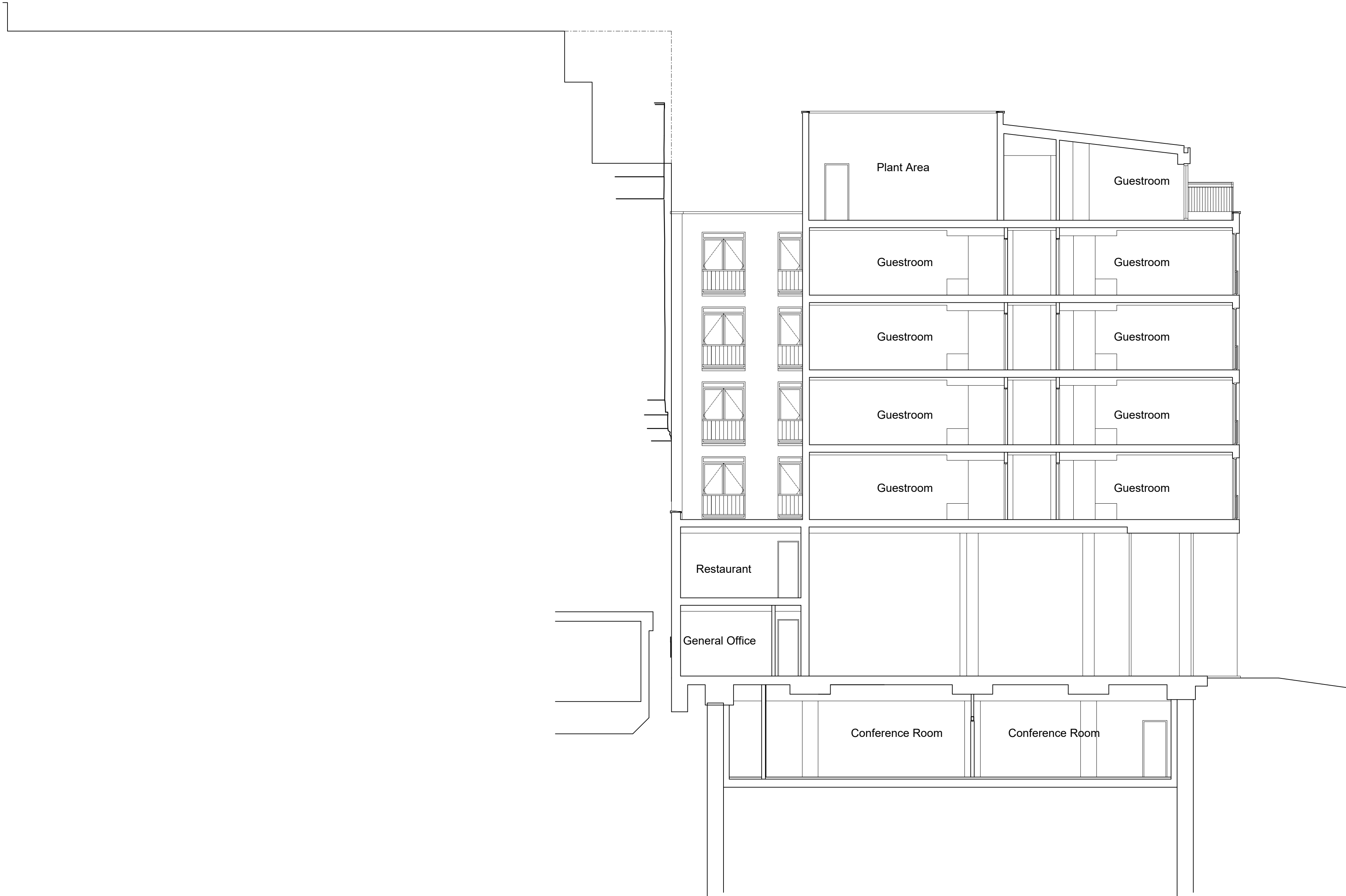
Short Section Scale 1:100 @A1