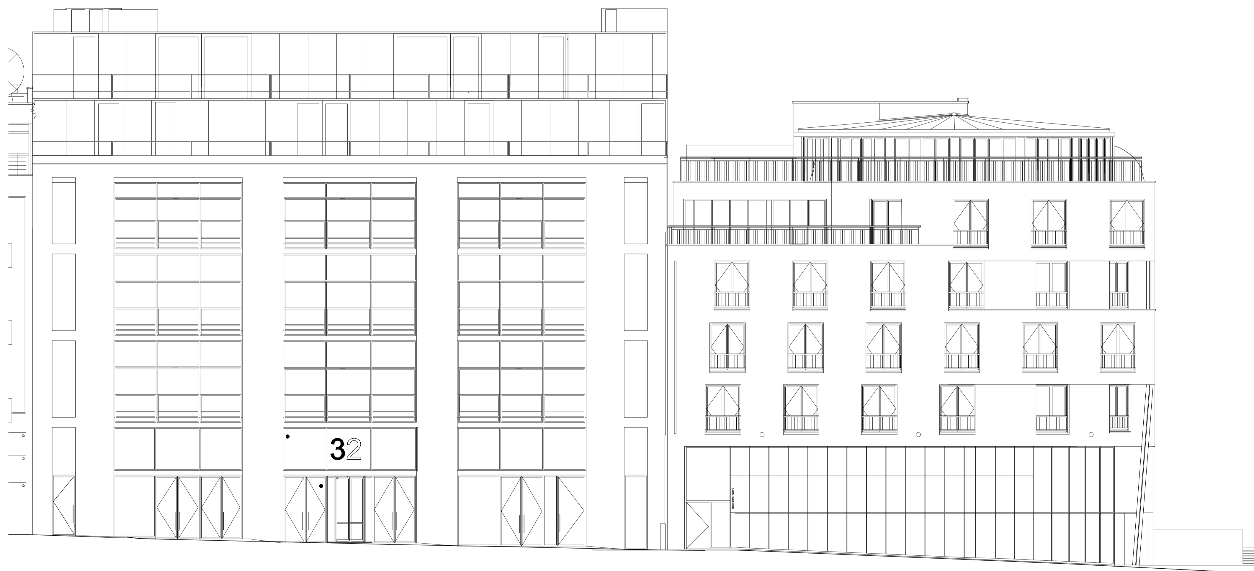
Jamestown Road Existing Elevation Scale 1:100 @A1