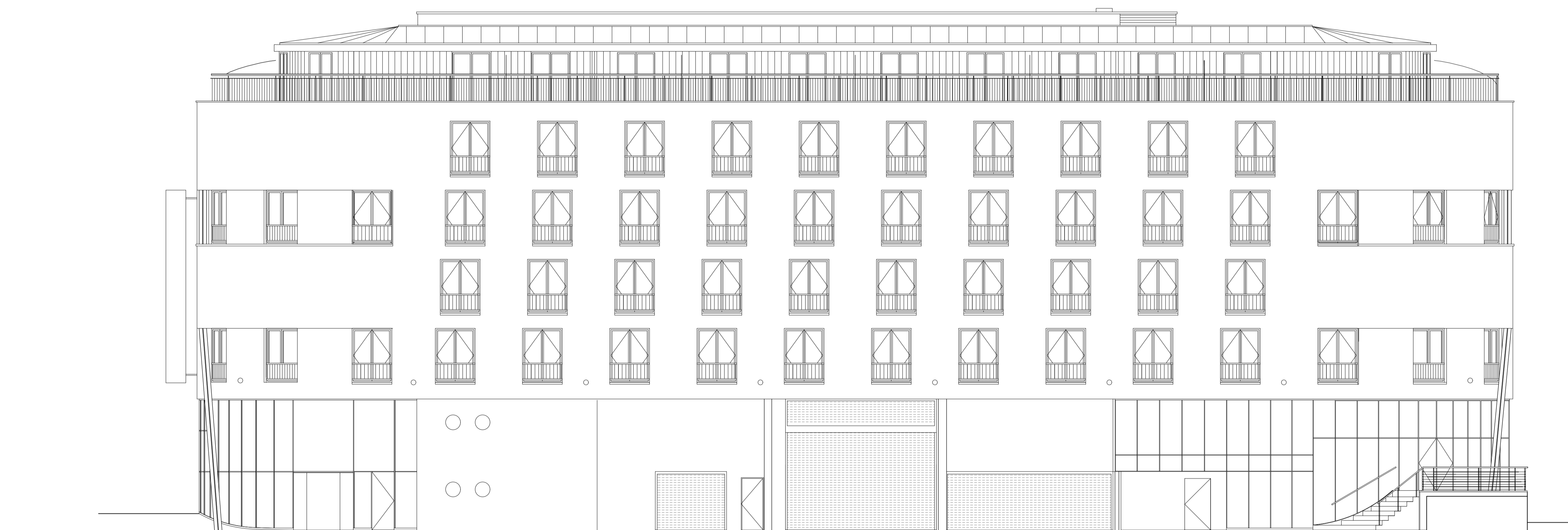
East Elevation Scale 1:100 @A1