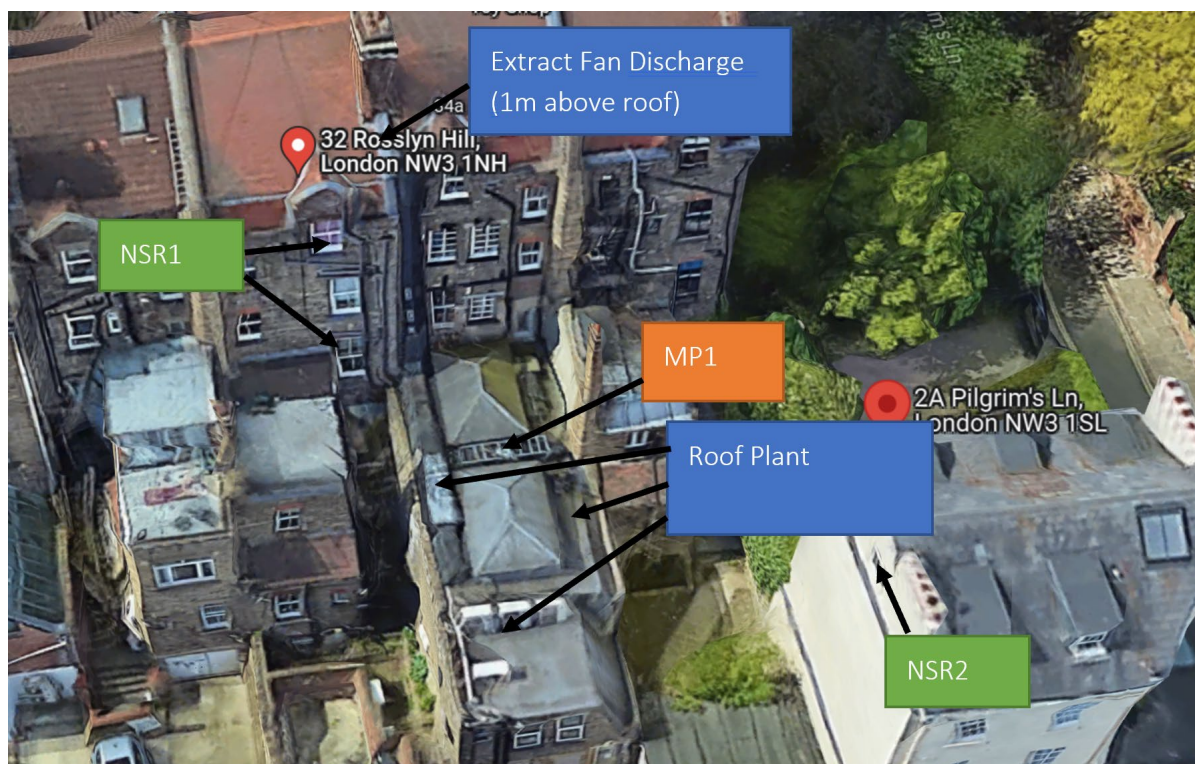
Figure 1: Aerial photograph showing equipment location and most noise-sensitive receptor

Figure 1 below shows the location of the proposed equipment, receptors, and background survey measurement position.