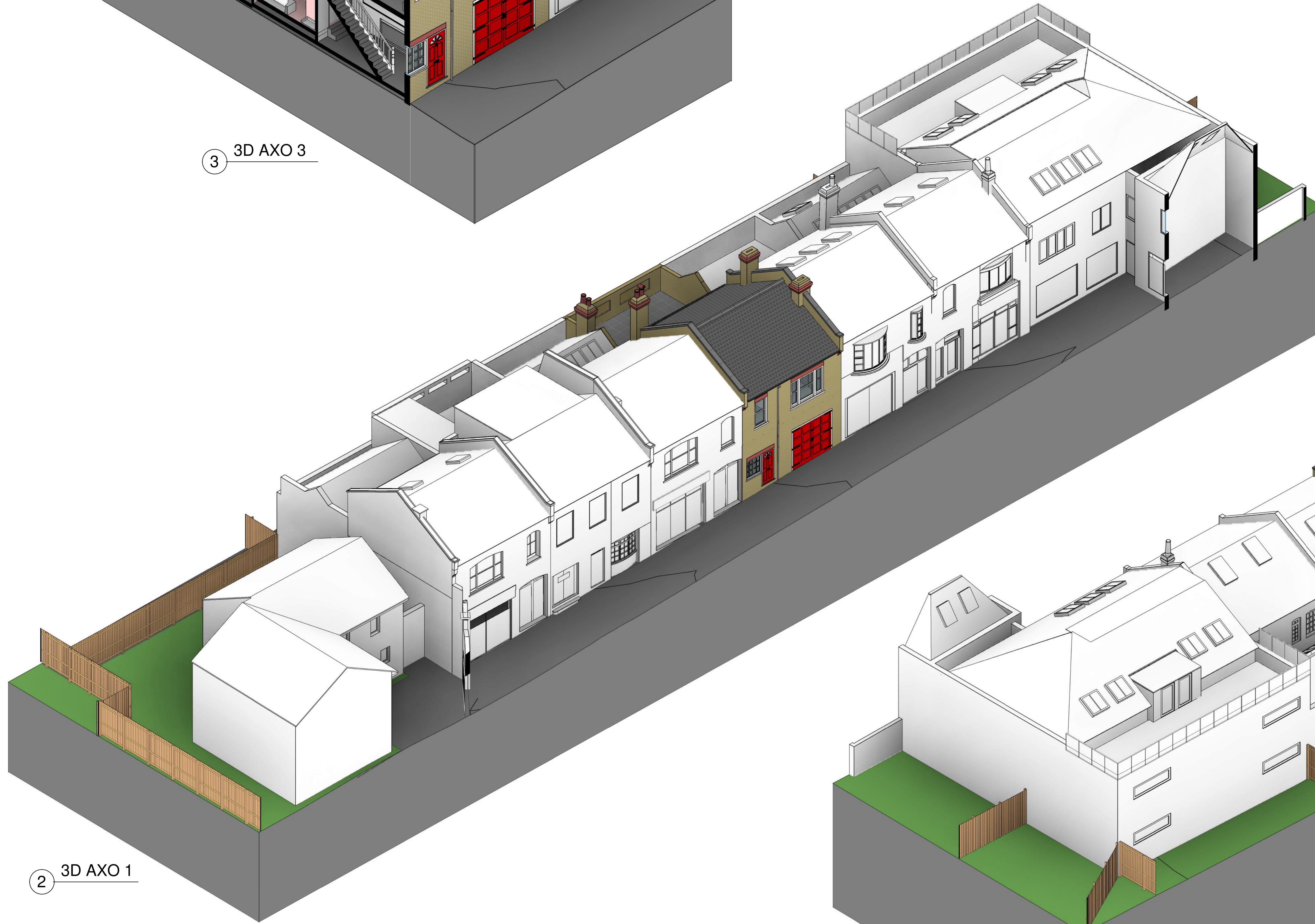
2 3D AXO 1