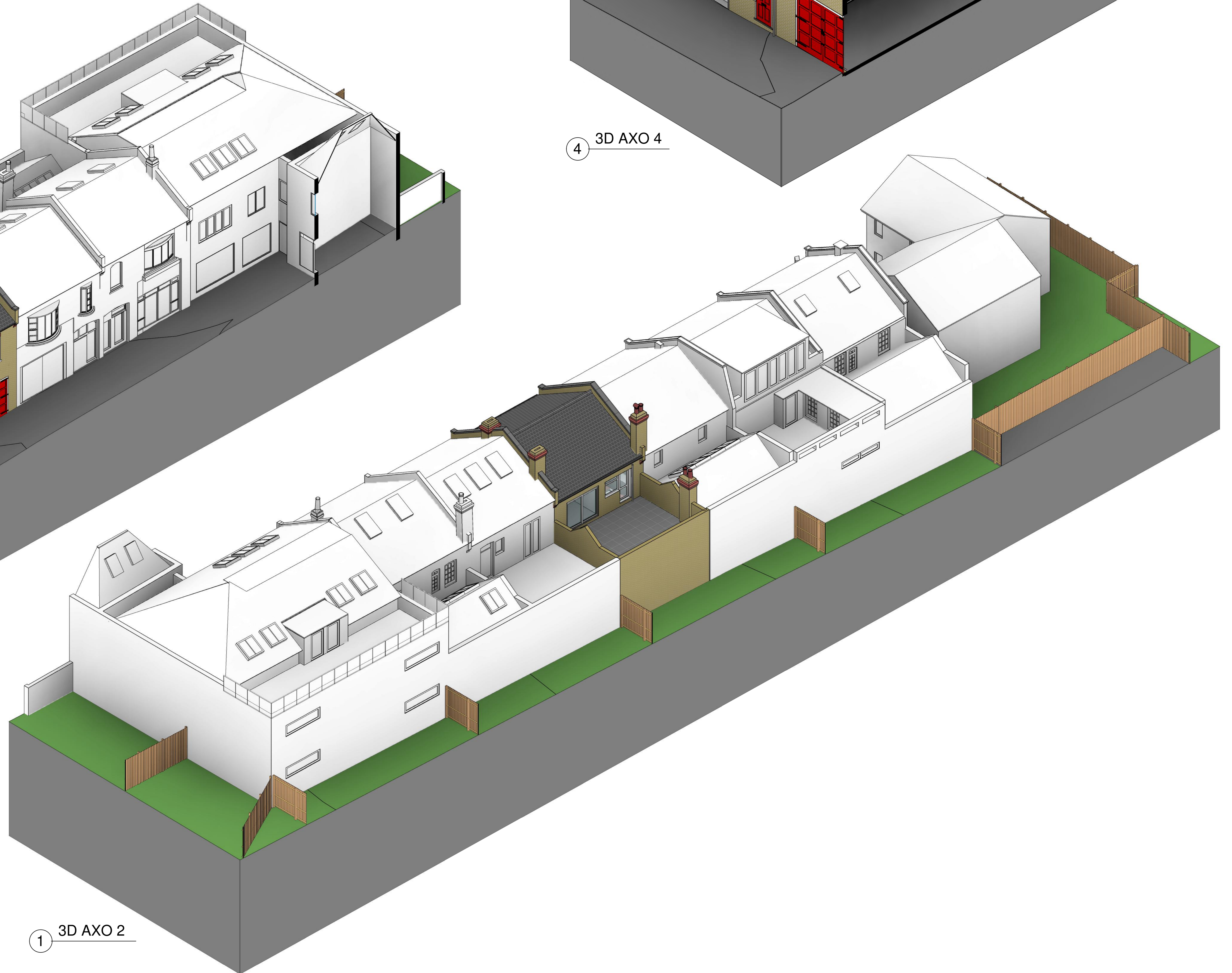
1 3D AXO 2