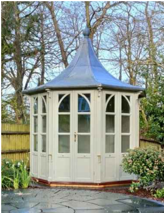
IMAGE OF PROPOSED SUMMER HOUSE