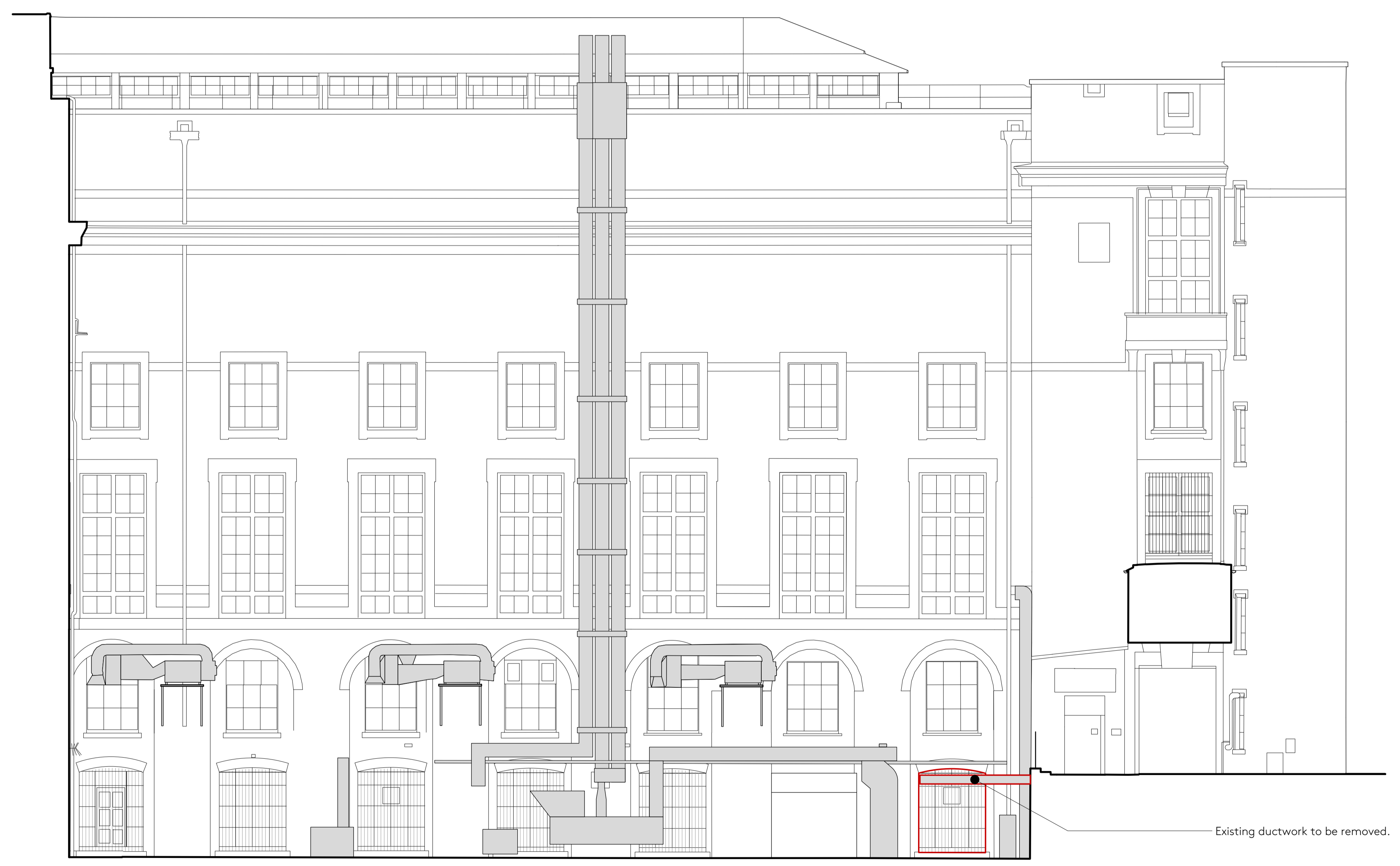
1 East Elevation - Existing Scale: 1:100