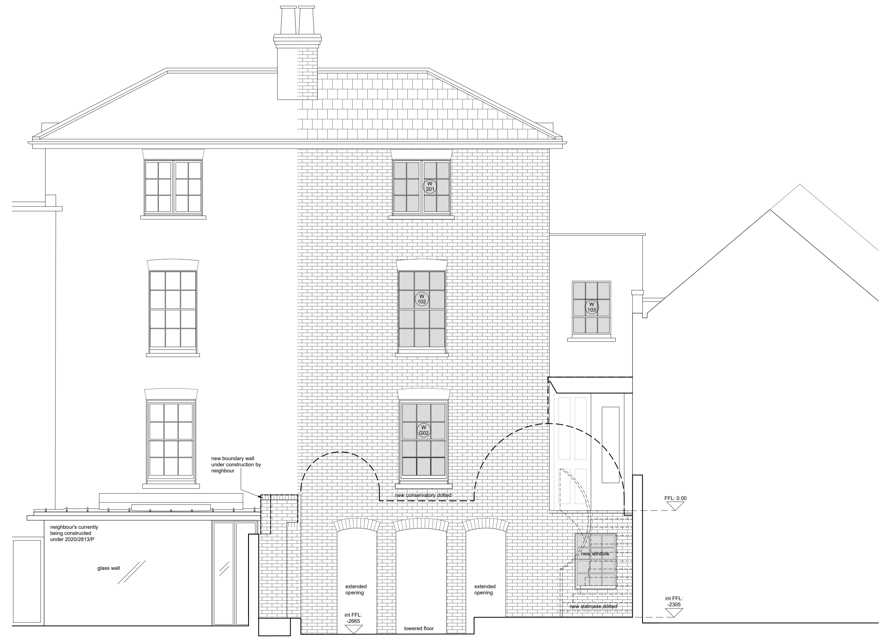
Rear Elevation: conservatory dotted