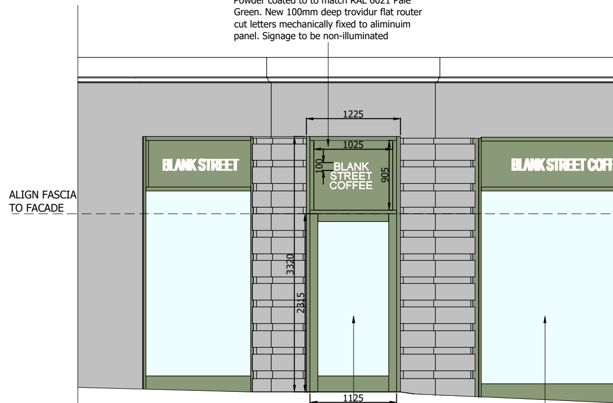
ELEVATION B: CORNER ELEVATION SCALE: 1:50@A3

Sign B= New 1025x905mm Ali panel. Powder coated to to match RAL 6021 Pale Green. New 100mm deep trovidur flat router cut letters mechanically fixed to aliminuim panel. Signage to be non-illuminated