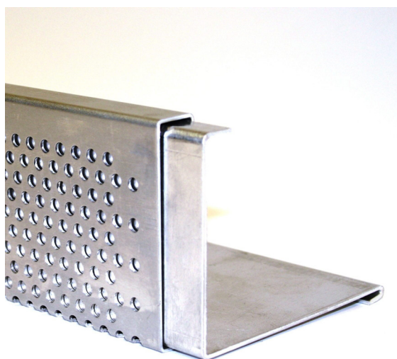
Aluminium roof edge drainage profile

Proposal for 17 Tanza Road, green roof to new garden room: The Green Roof Company 'Sempergreen Lightweight System' or similar extensive green roof system with sedum blanket.