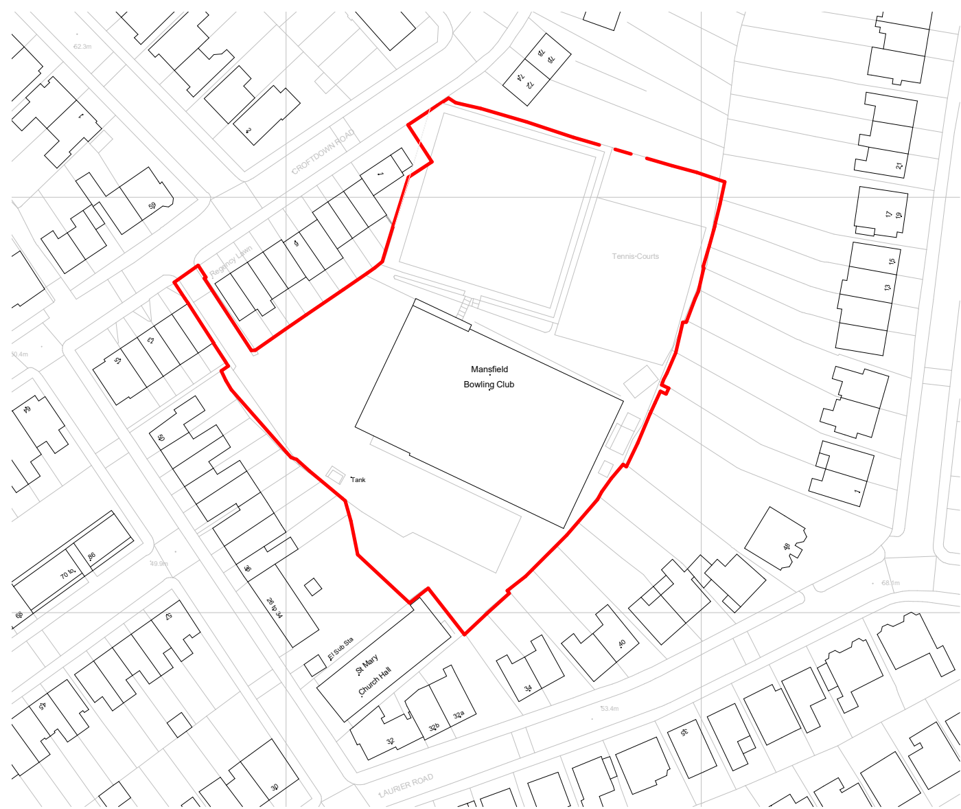
Location Plan 1 : 1250