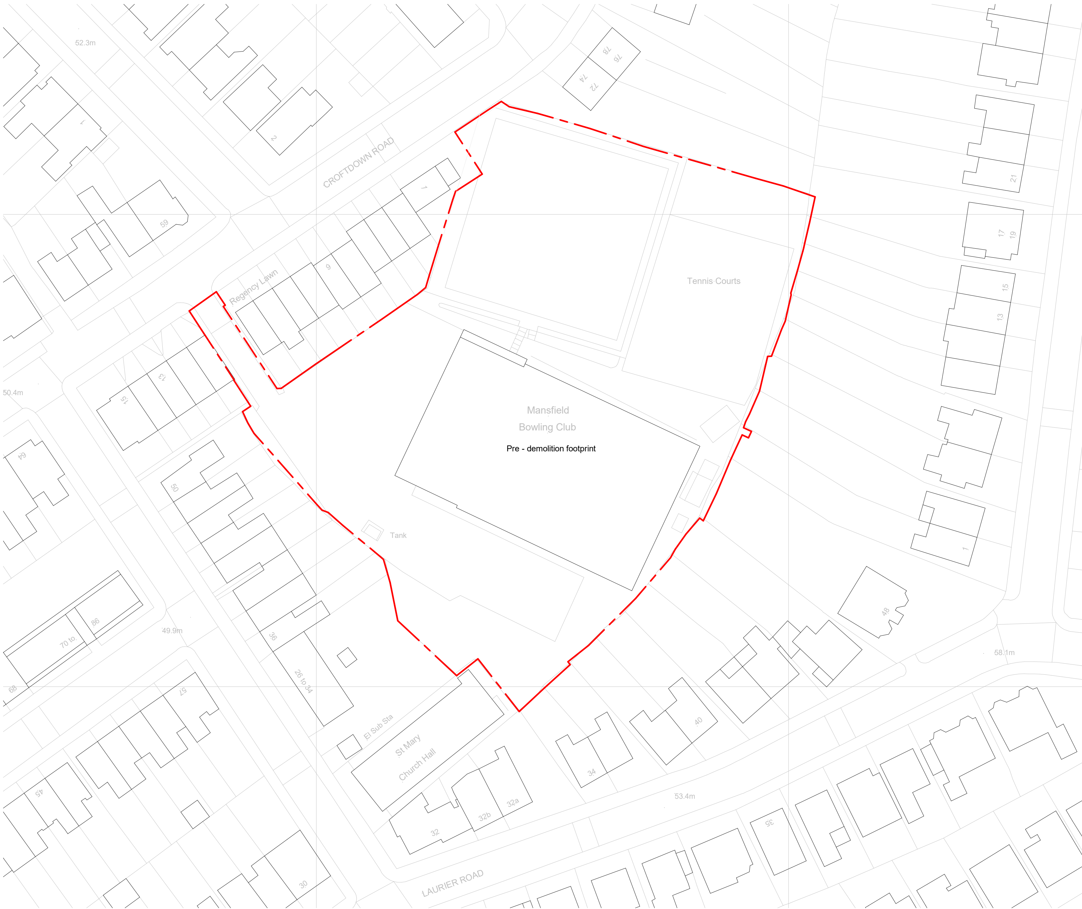
Block Plan 1 : 500