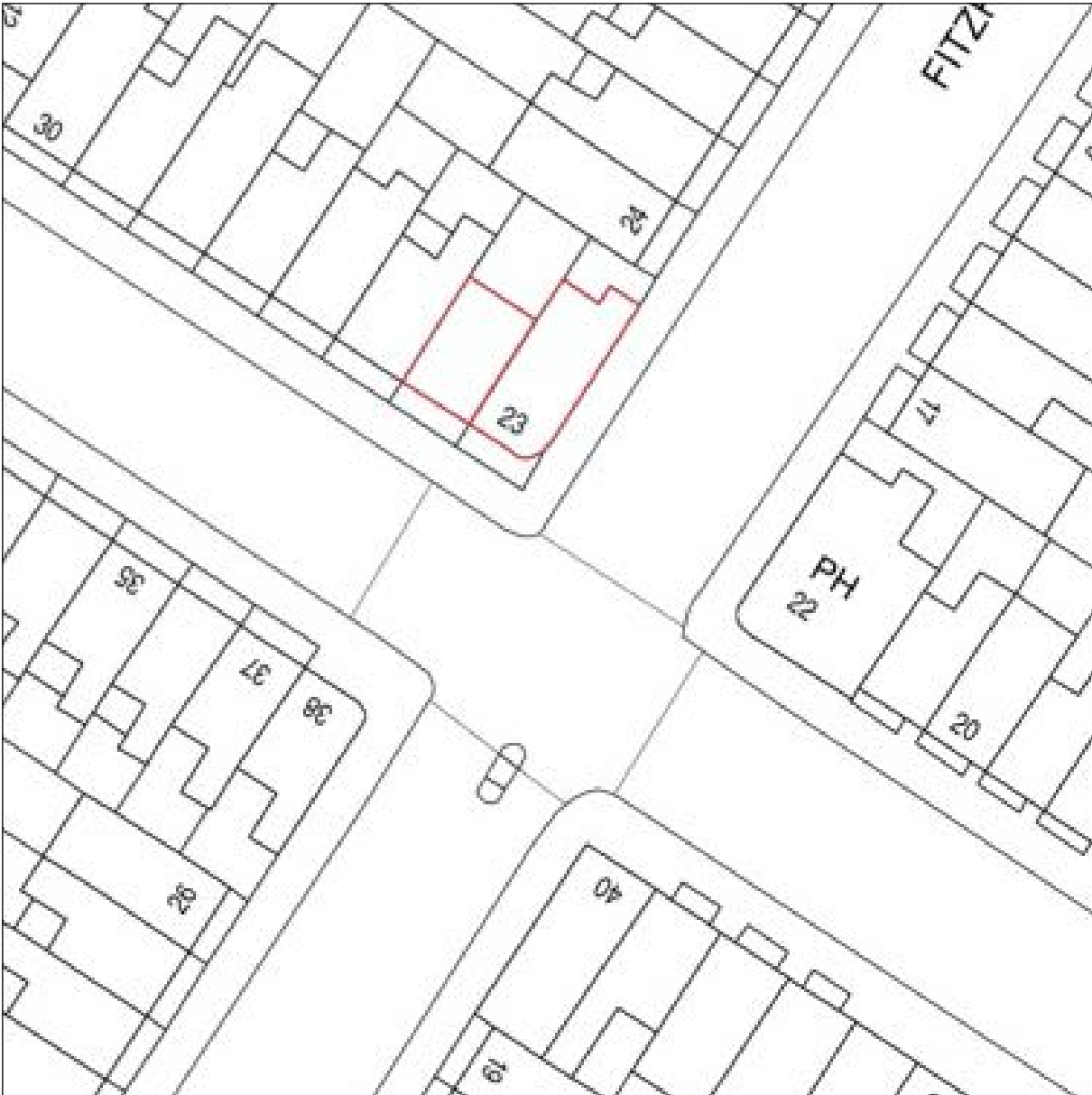
1 Site Block Plan Scale: 1:500