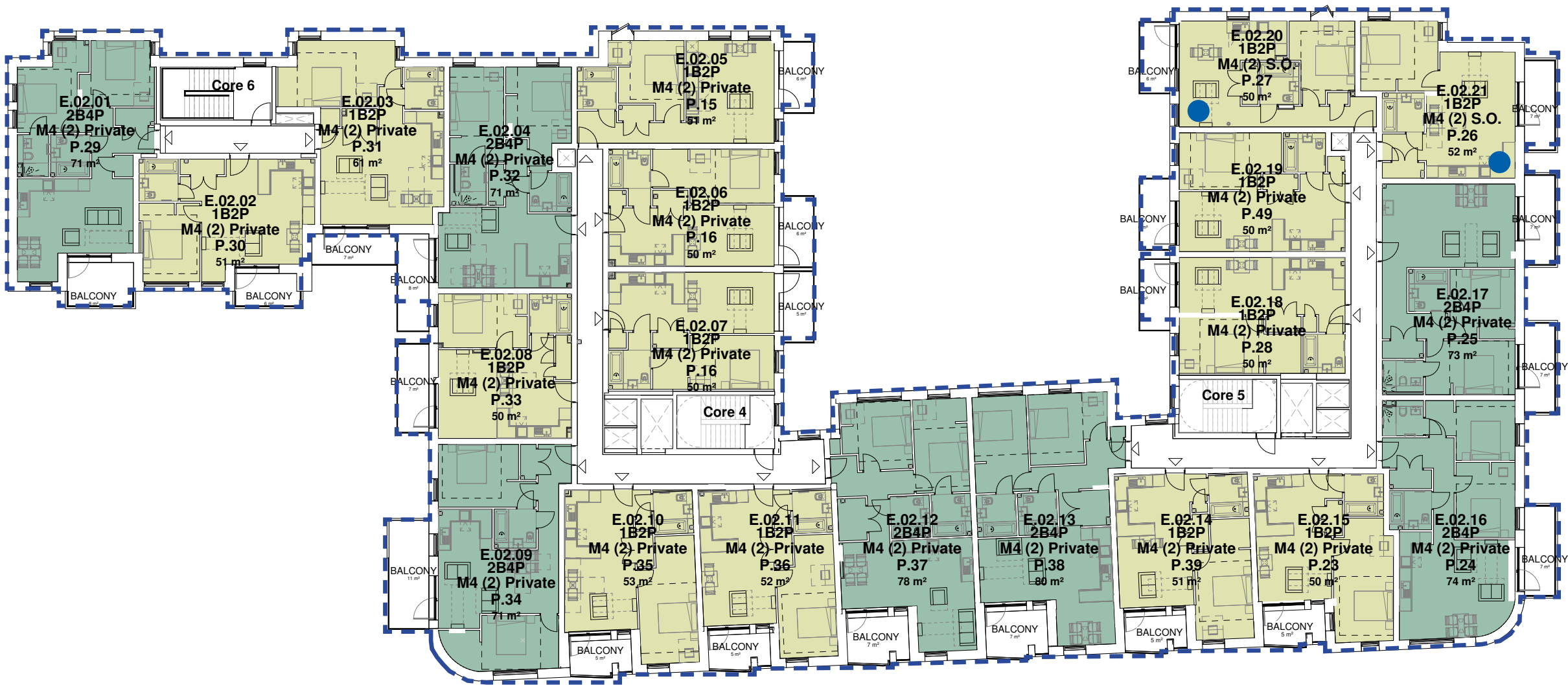
Proposed Second Floor Plan - scale 1:250