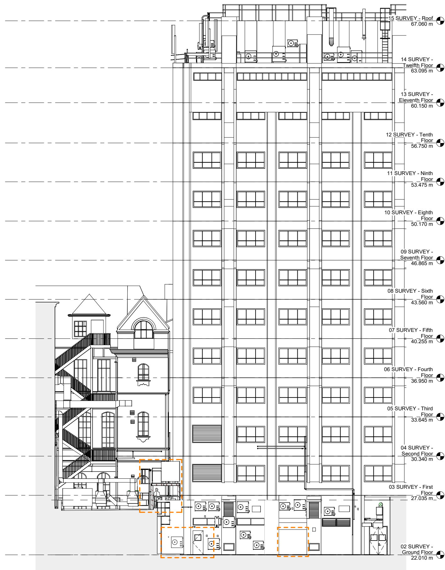
2 East Section / Elevation E - Existing 1 : 100

Work completed under previously consented planning applications ref: - 2021/5687/P - 2022/3498/P