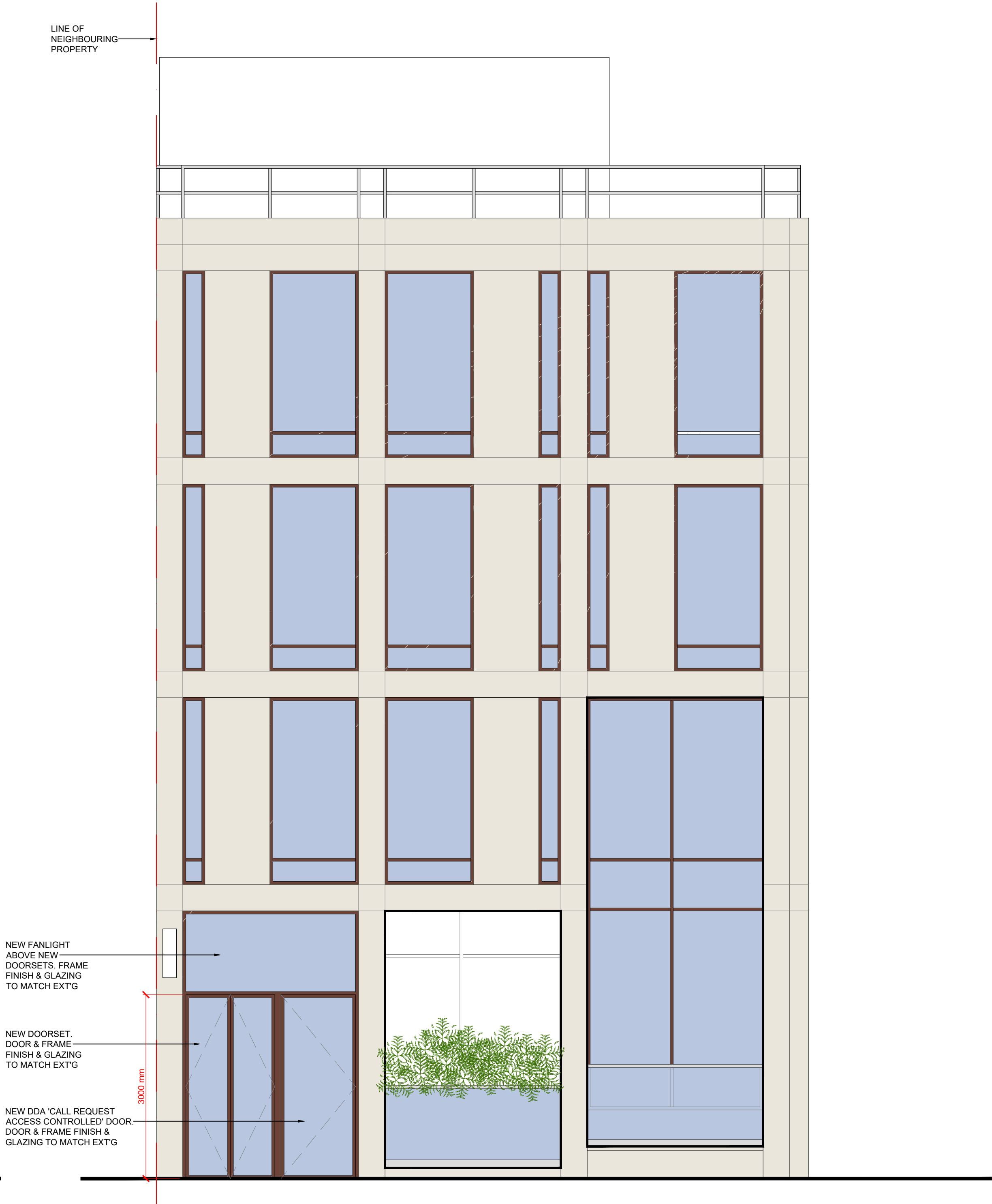
FRONT ELEVATION - AS PROPOSED SCALE 1:50

A 16.11.22 NOTE RELATING TO DDA DOORSET ADDED