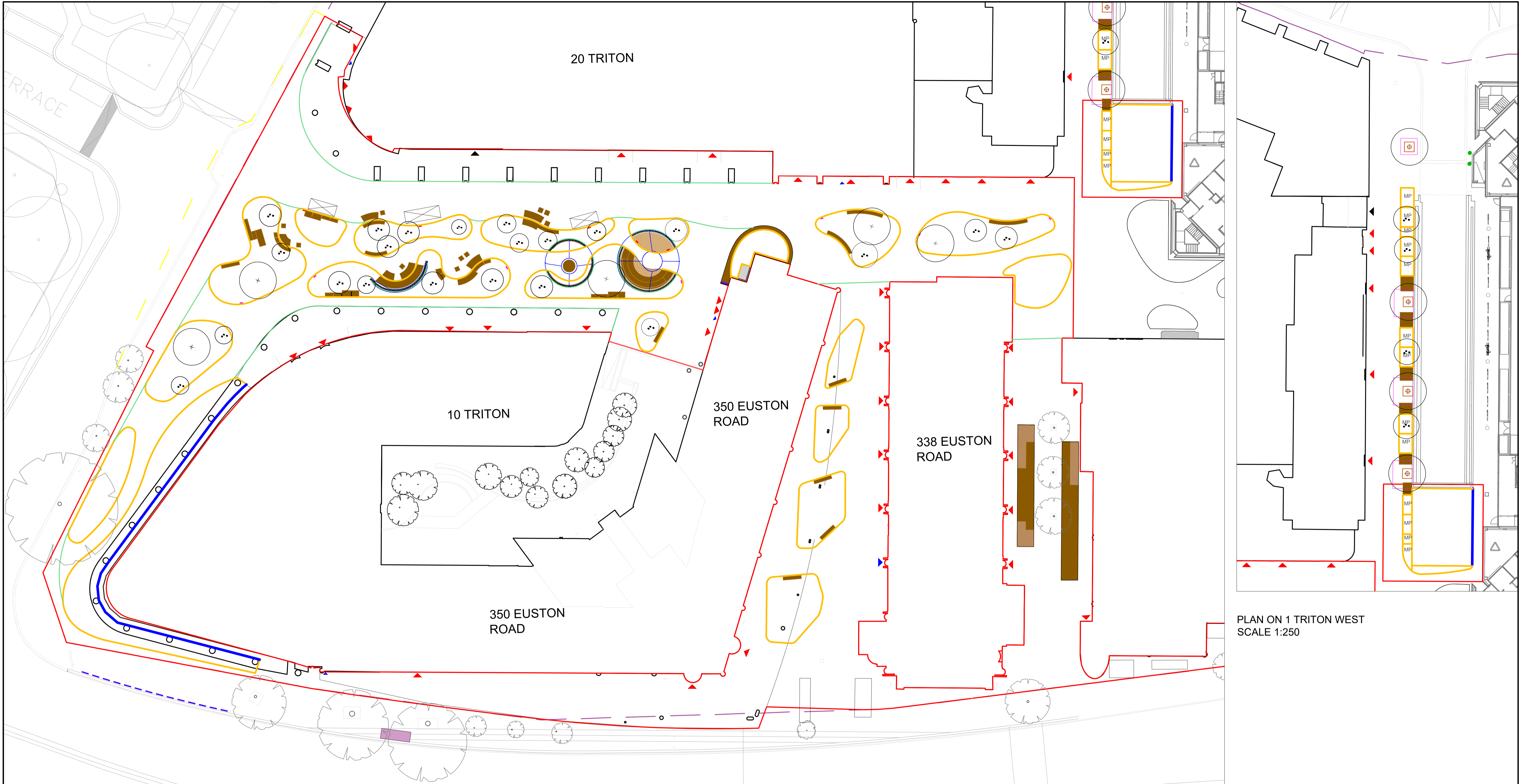
PLAN ON 1 TRITON WEST SCALE 1:250