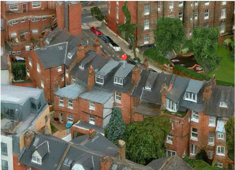
AERIEL VIEW SHOWING DORMERS