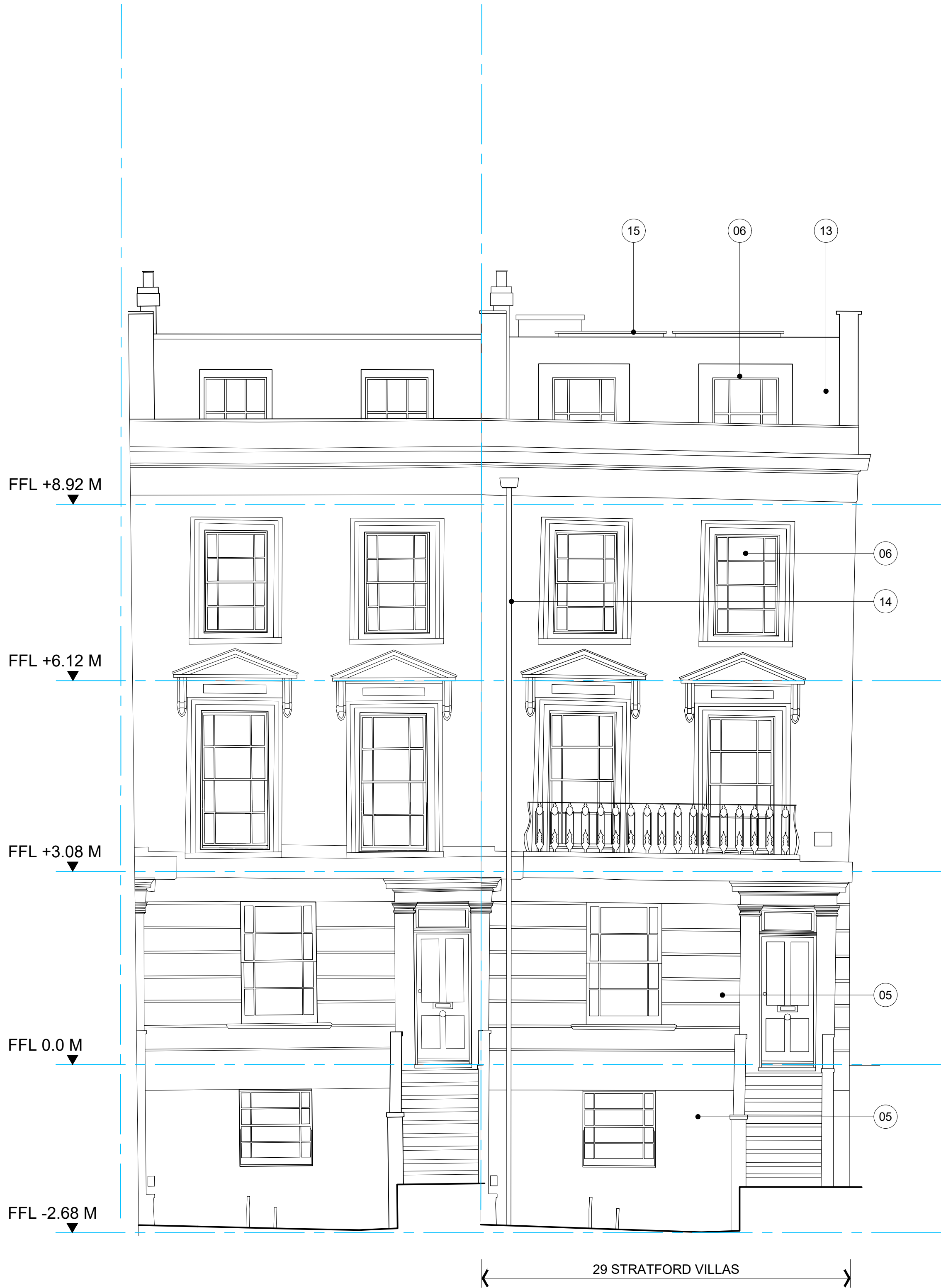
01 PROPOSED FRONT ELEVATION EL-110 1:50@A1 / 1:100@A3

NOTE: ALL EXISTING SINGLE GLAZED SASH WINDOWS TO BE REPLACED WITH DOUBLE GLAZED SASH WINDOWS. REFER TO DRAWING DE-010 FOR WINDOW DETAILS