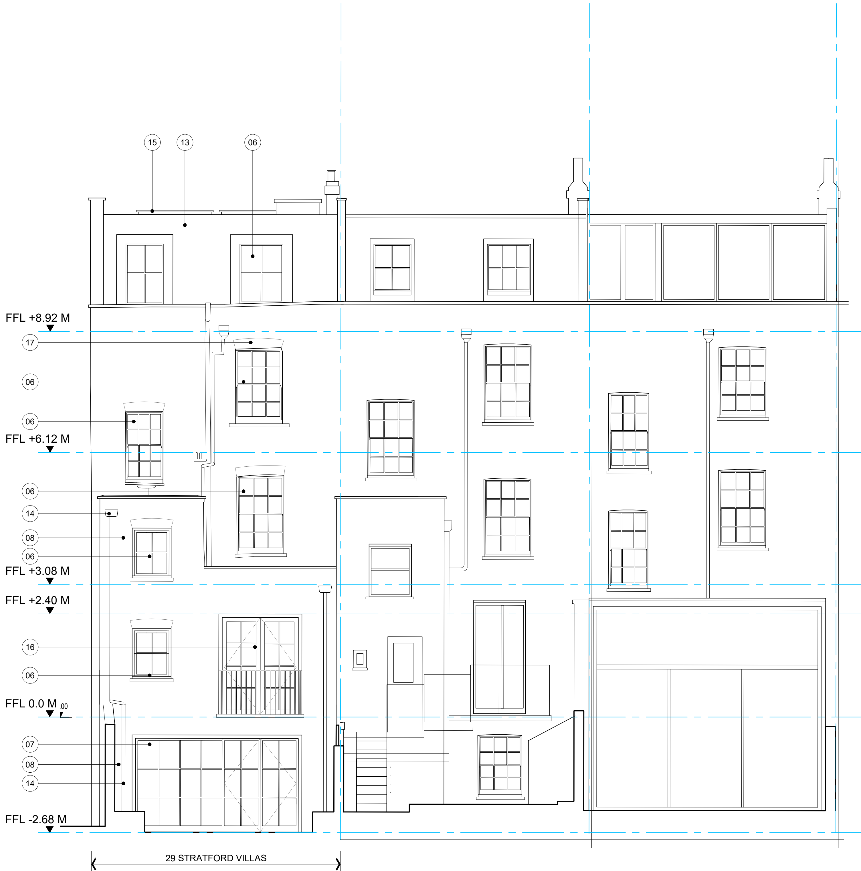
02 PROPOSED REAR ELEVATION EL-110 1:50@A1 / 1:100@A3

ALL DIMENSIONS MUST BE CHECKED ON SITE INFORM THE ARCHITECT OF ANY DISCREPANCIES PRIOR TO CONSTRUCTION