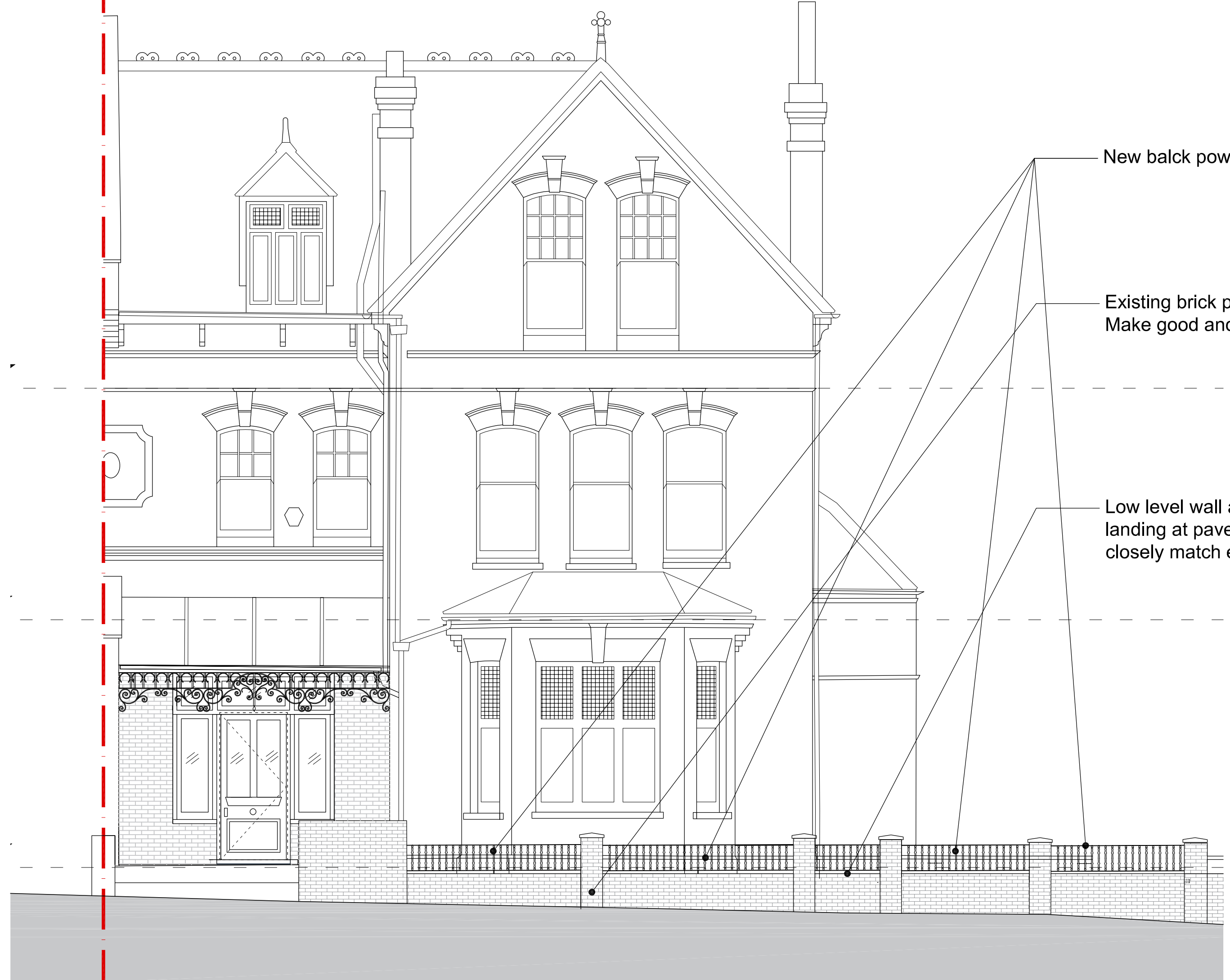
Front elevation 01