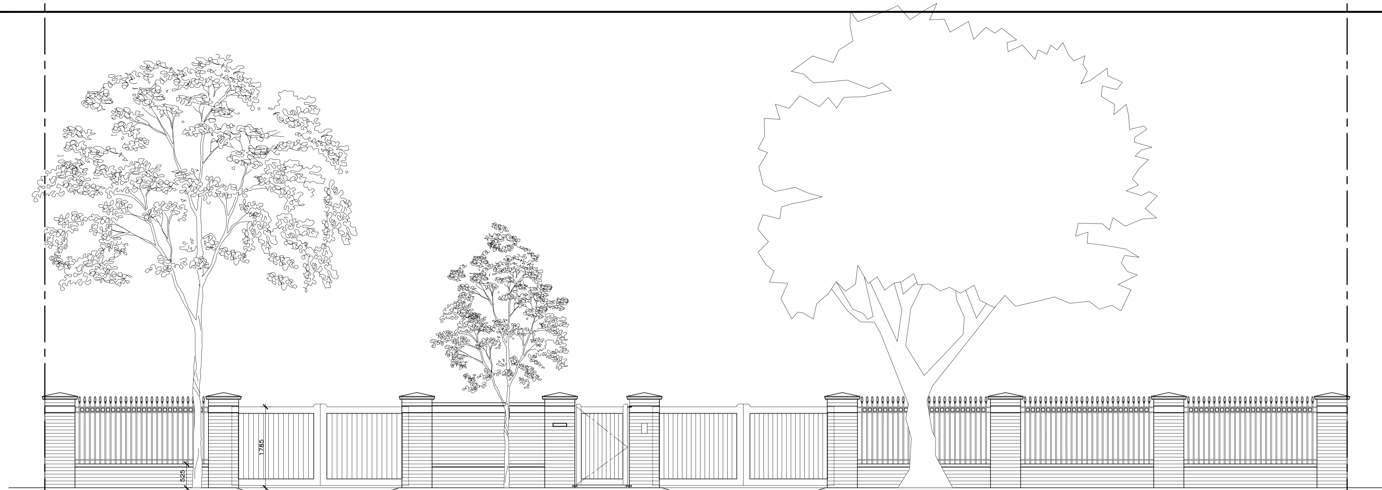
CONSENTED FRONT ENTRANCE GATES AND WALL ELEVATION