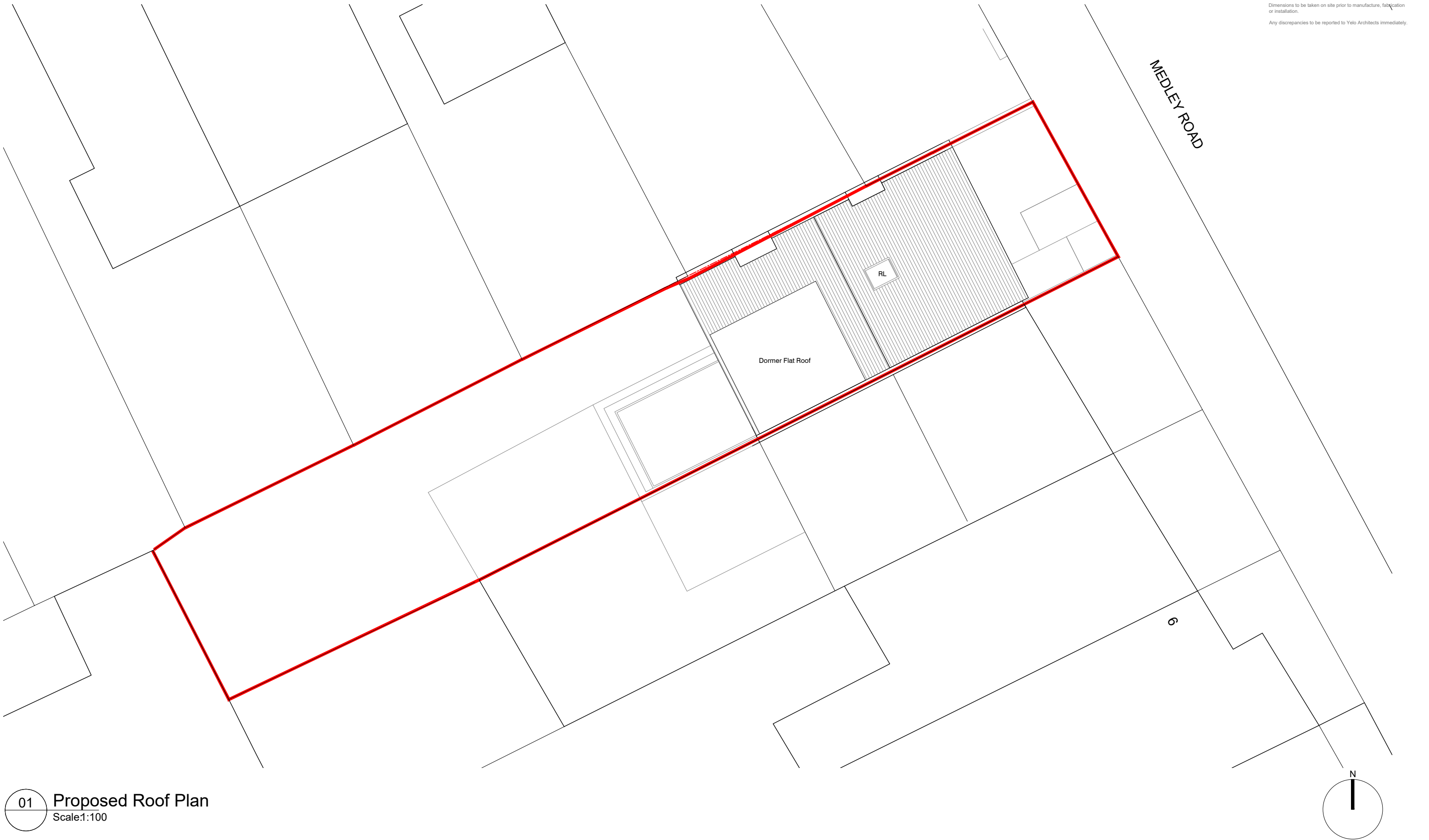
01 Proposed Roof Plan Scale:1:100

Do not scale from this drawing. Work to figured dimensions only. Dimensions to be taken on site prior to manufacture, fabrication or installation. Any discrepancies to be reported to Yelo Architects immediately.