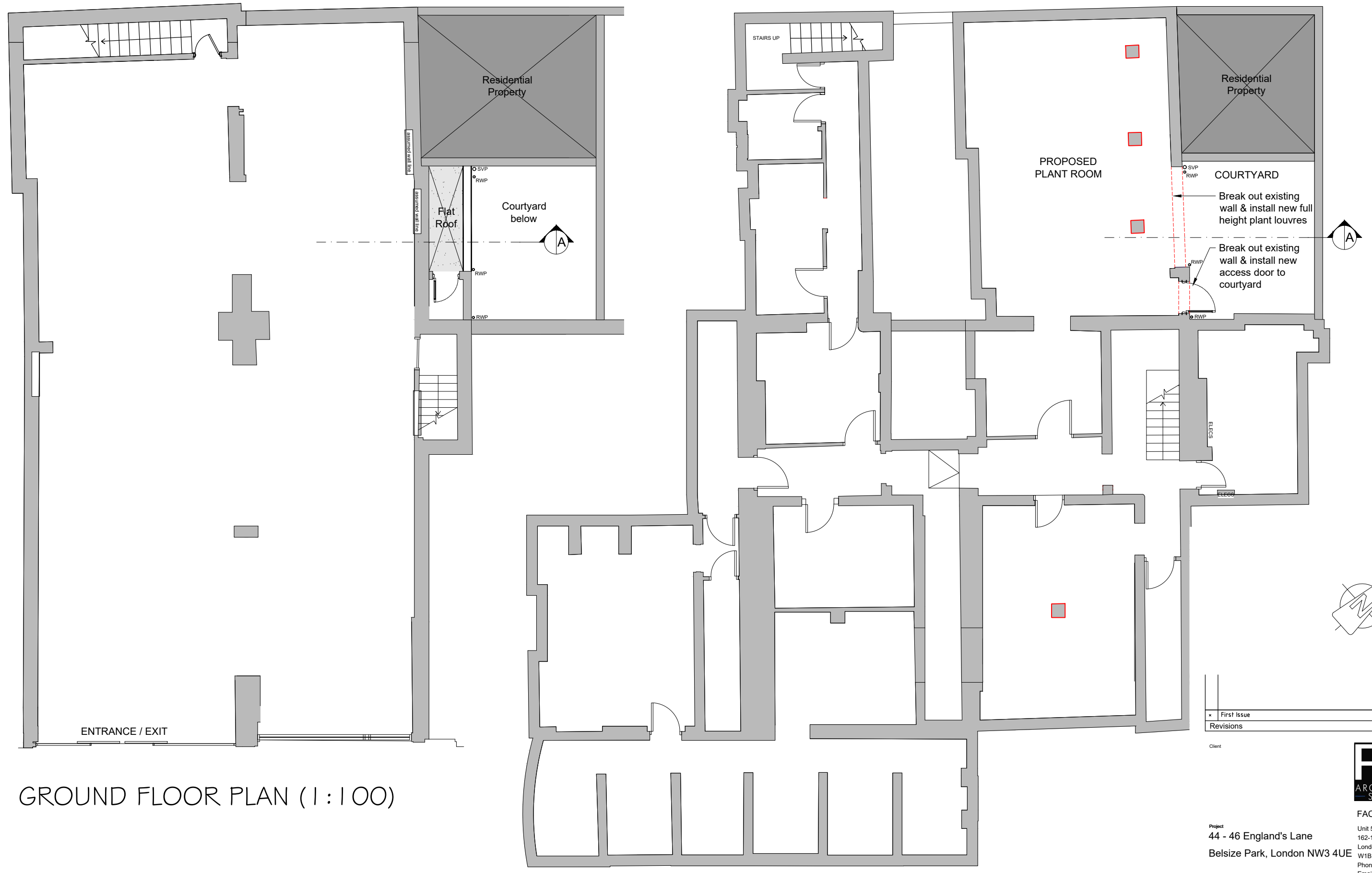
GROUND FLOOR PLAN (1:100)