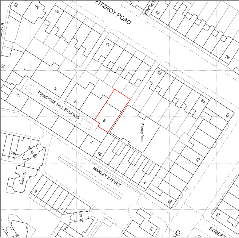
LOCATION PLAN (Scale in 1:1250 @A3)

Copyright of Base Building Consultancy Ltd. CONFIDENTIAL. This drawing is the property of Base Building Consultancy Ltd. No disclosure or copy of it may be made without the written permission of Base Building Consultancy Ltd.