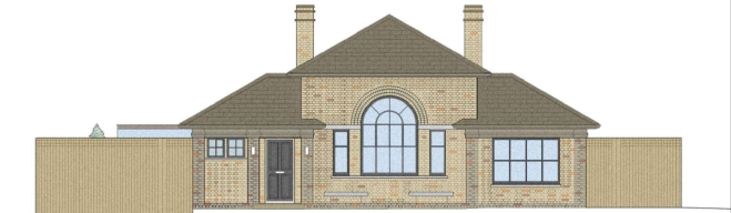
3. Existing North (Front) Elevation Street View