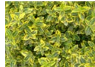
Euonymus Emerald n Gold - 10%