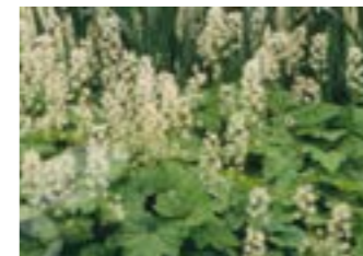
Tiarelle Cordifolia - 10%