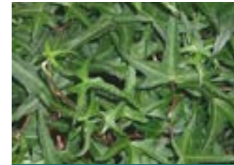
Hedera Helix 'Saggitifolia' - 10%