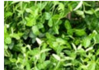
Euonymus Radicans - 10%