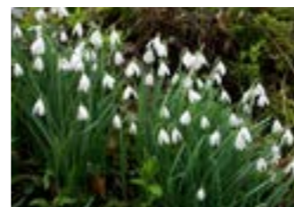
Galanthus Nivalis (Bulbs) - throughout 10%