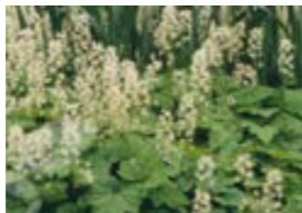
Tiarelle Cordifolia - 10%