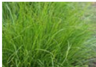
Carex Remota - 10%