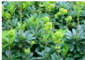
Euphorbiae Amygaloides Robbiae - 10%