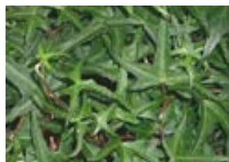
Hedera Helix 'Saggitifolia' - 10%