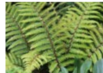
Dryopteris Affinis - 5%