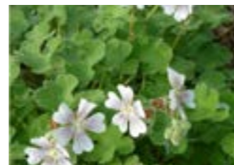
Geranium Renardii - 10%