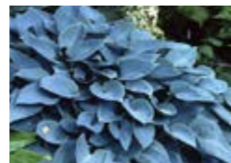
Hosta Halcyon - 10%