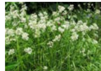
Luzula Nivea - 10%