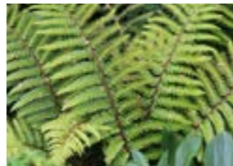
Dryopteris Affinis - 10%