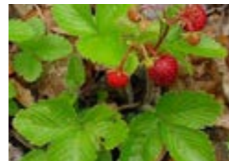
Fragaria Vesca - 10%