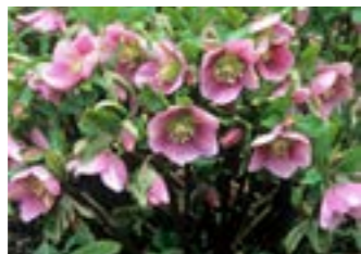
Helleborus Orientalis - 10%