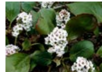
Bergenia Bressingham White - 20%