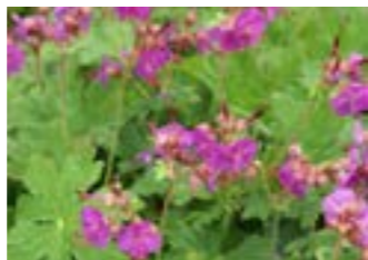
Geranium Macrorrhizum - 10%