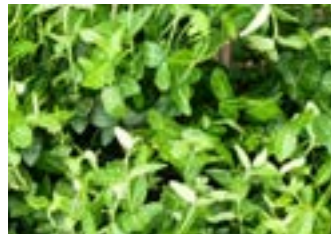
Euonymus Radicans - 20%