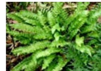
Asplenium Scolopendrium - 5%