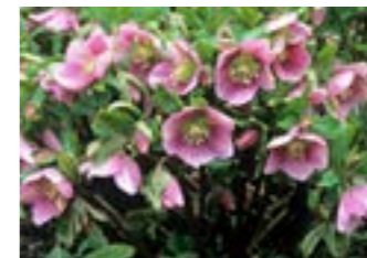
Helleborus Orientalis - 10%