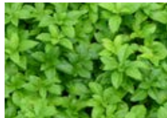
Pachysandra Terminalis - 20%