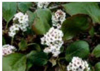
Bergenia Bressingham White - 10%