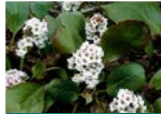
Bergenia Bressingham White - 20%