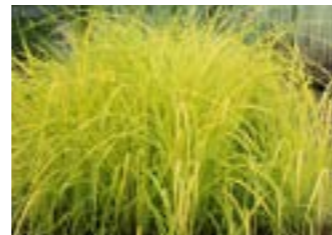
Carex elata 'Aurea' - 10%