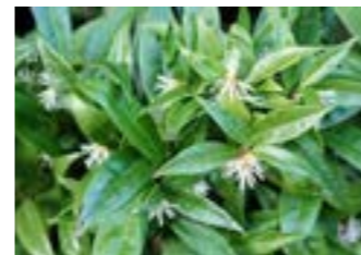
Sarcococca hookierana var humilis - 10%