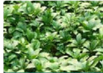
Pachysandra Terminalis 'Green Carpet' - 100%