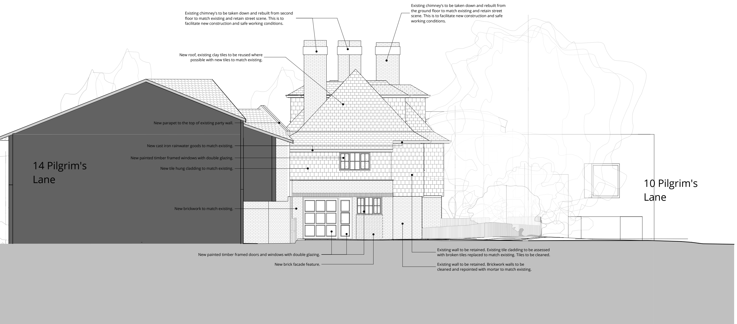
West Elevation - Proposed 1 : 100