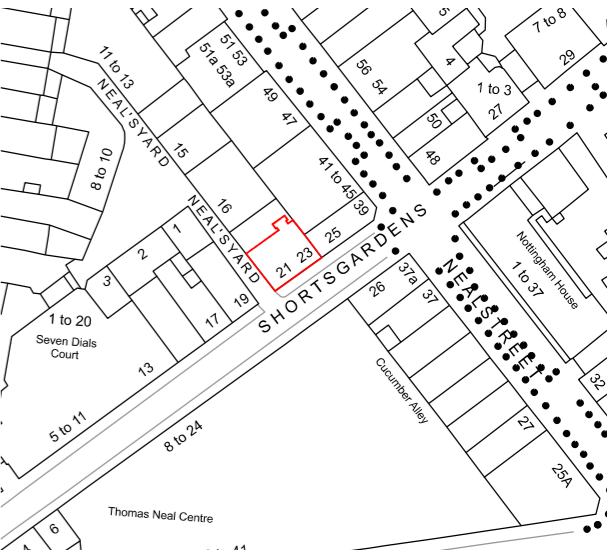
01 Location Plan NTS