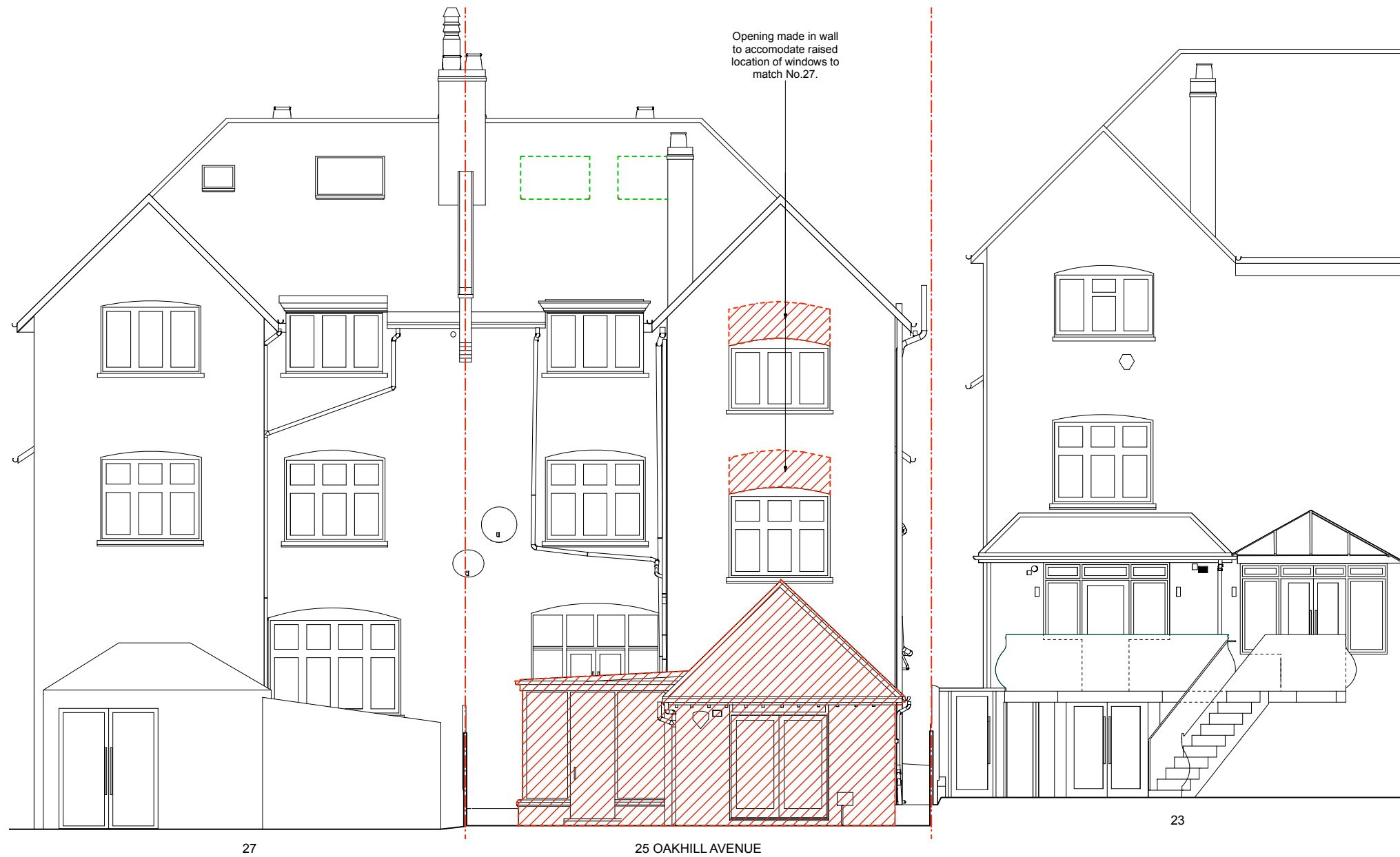
1 EXISTING REAR ELEVATION 1:100 @ A3