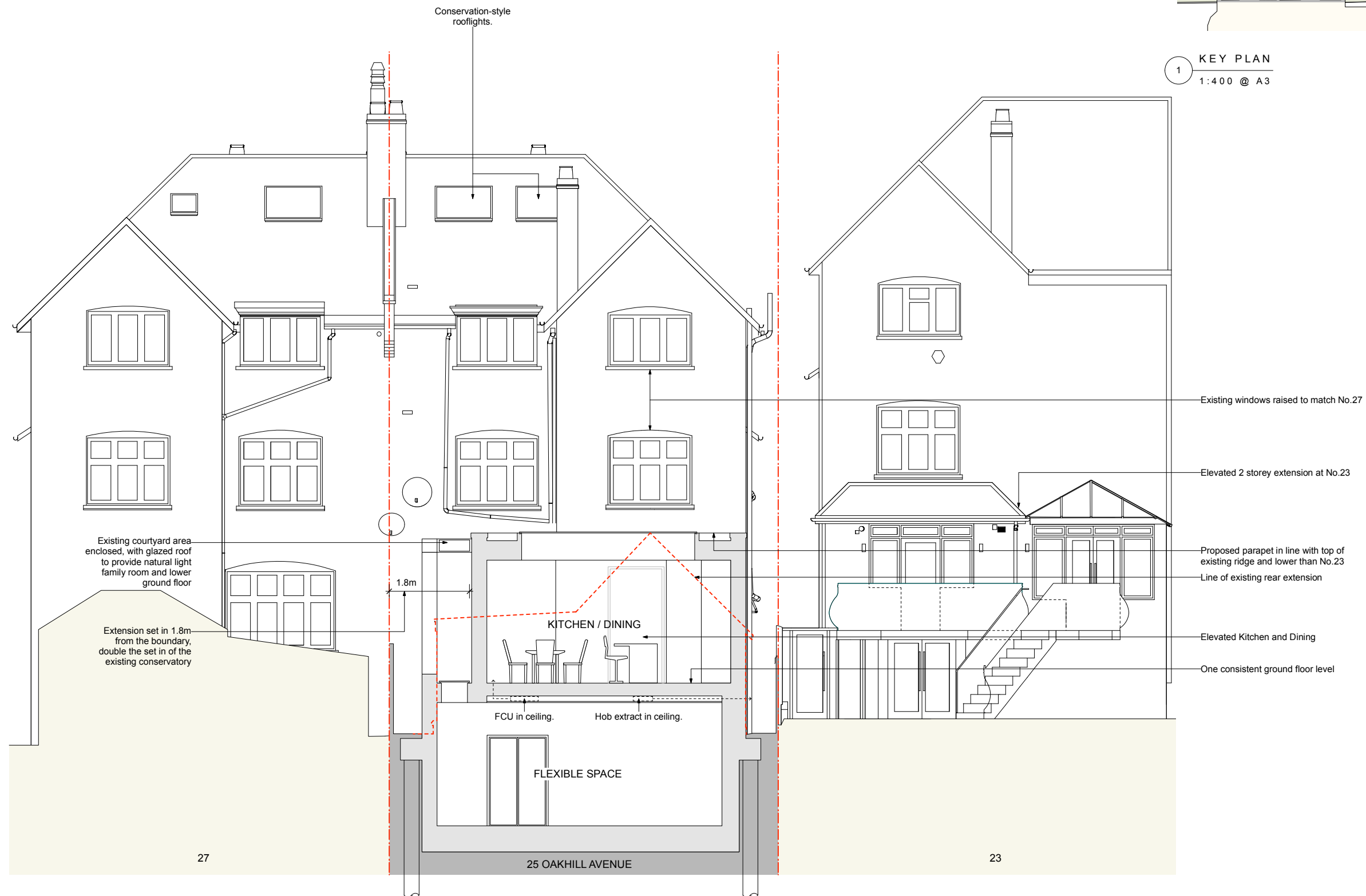
PROPOSED SECTION EE 1:100 @ A3

P1 12.10.22 issued for Planning rev date note do not scale drawing copyright tff architects ltd