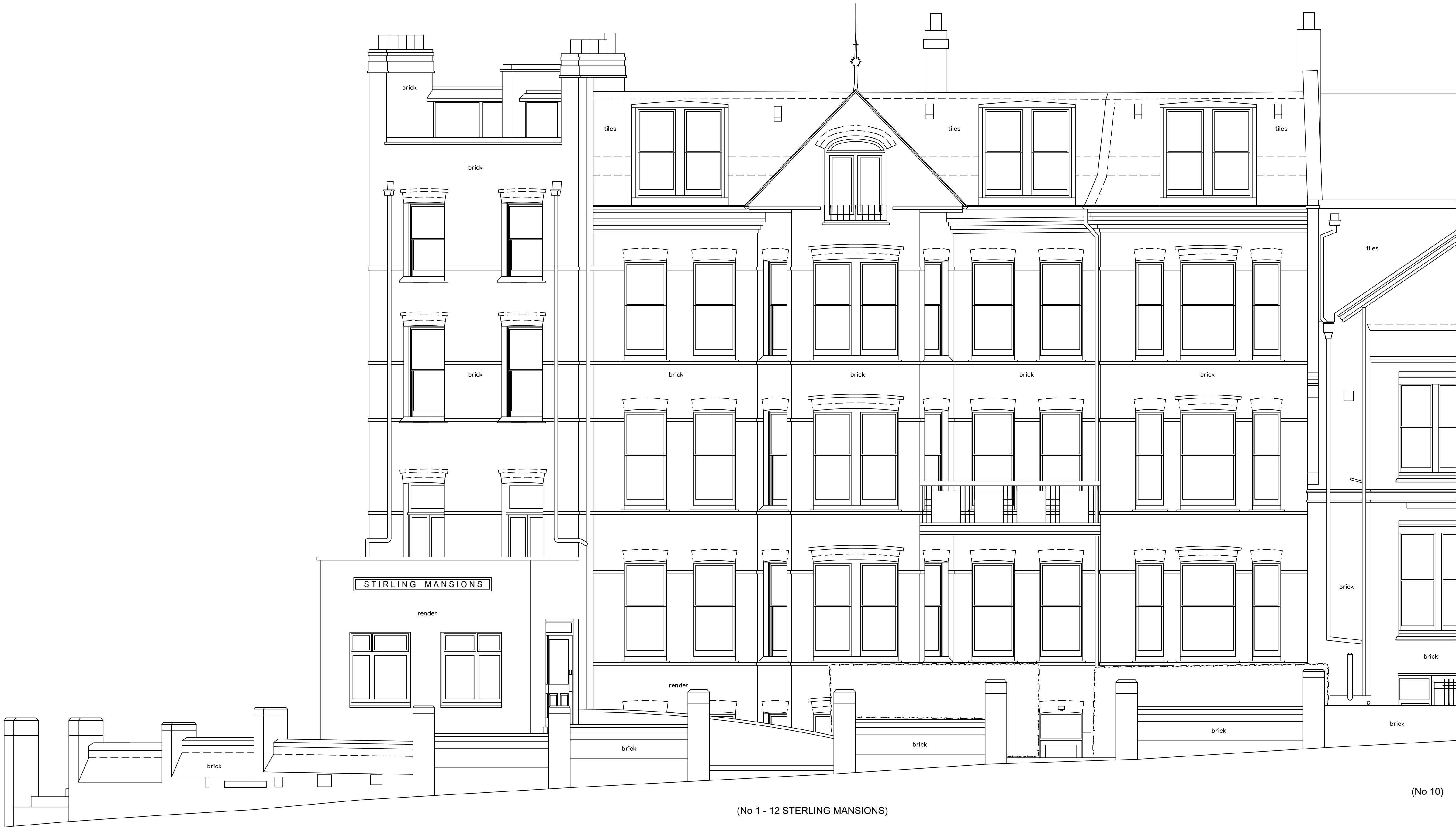
SOUTH-EAST ELEVATION 45.00m A.O.D.

THIS SURVEY HAS BEEN PREPARED WITH A SCALING ACCURACY FOR A PLOT AT A SCALE OF 1:50. ALL LEVELS ARE IN METRES RELATED TO AN ORDNANCE SURVEY BENCHMARK LOCATED ON THE BOUNDARY WALL OF No 23 & 25 CANFIELD GARDENS (value 46.11m).