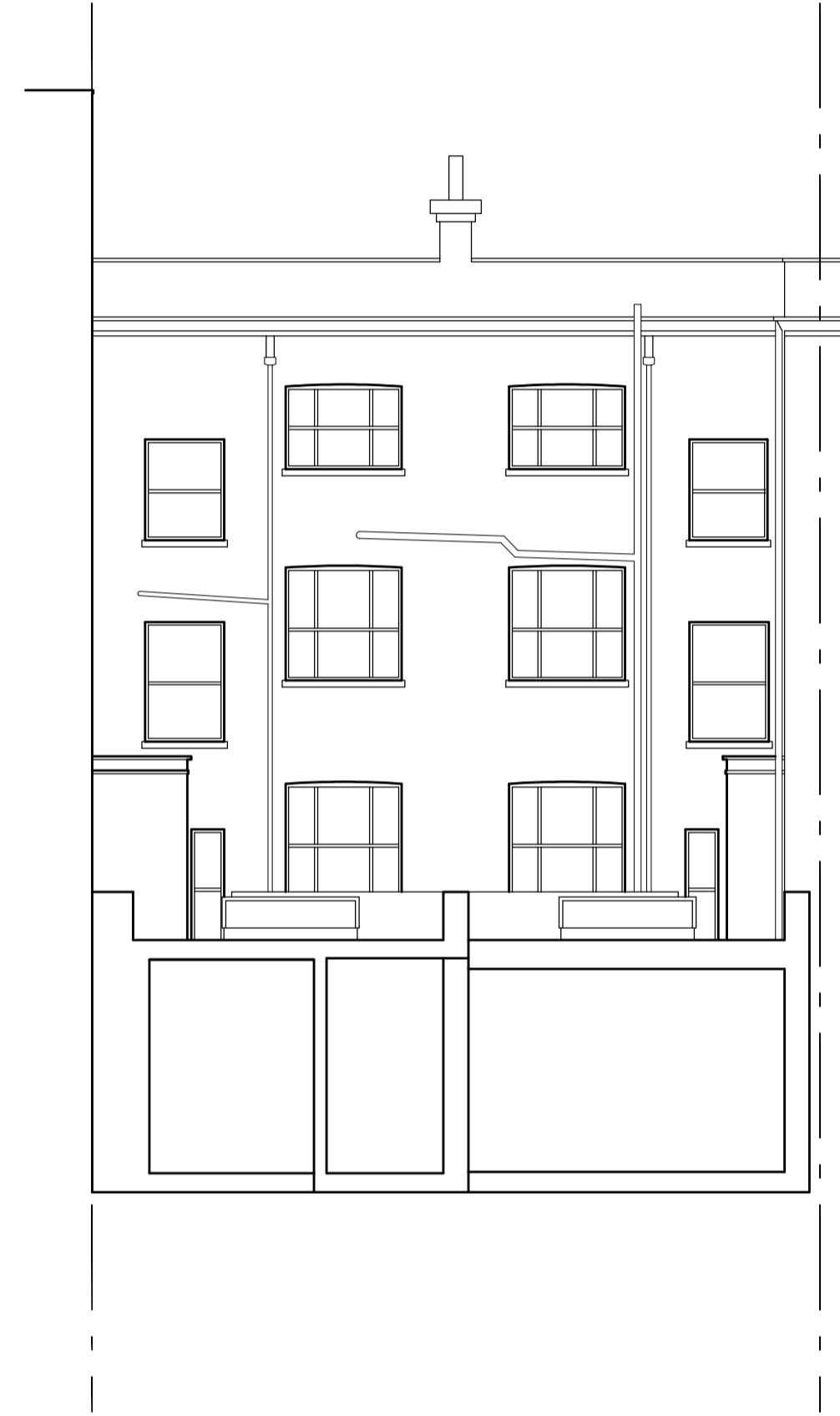
Existing Section AA & Demolitions Scale 1:100