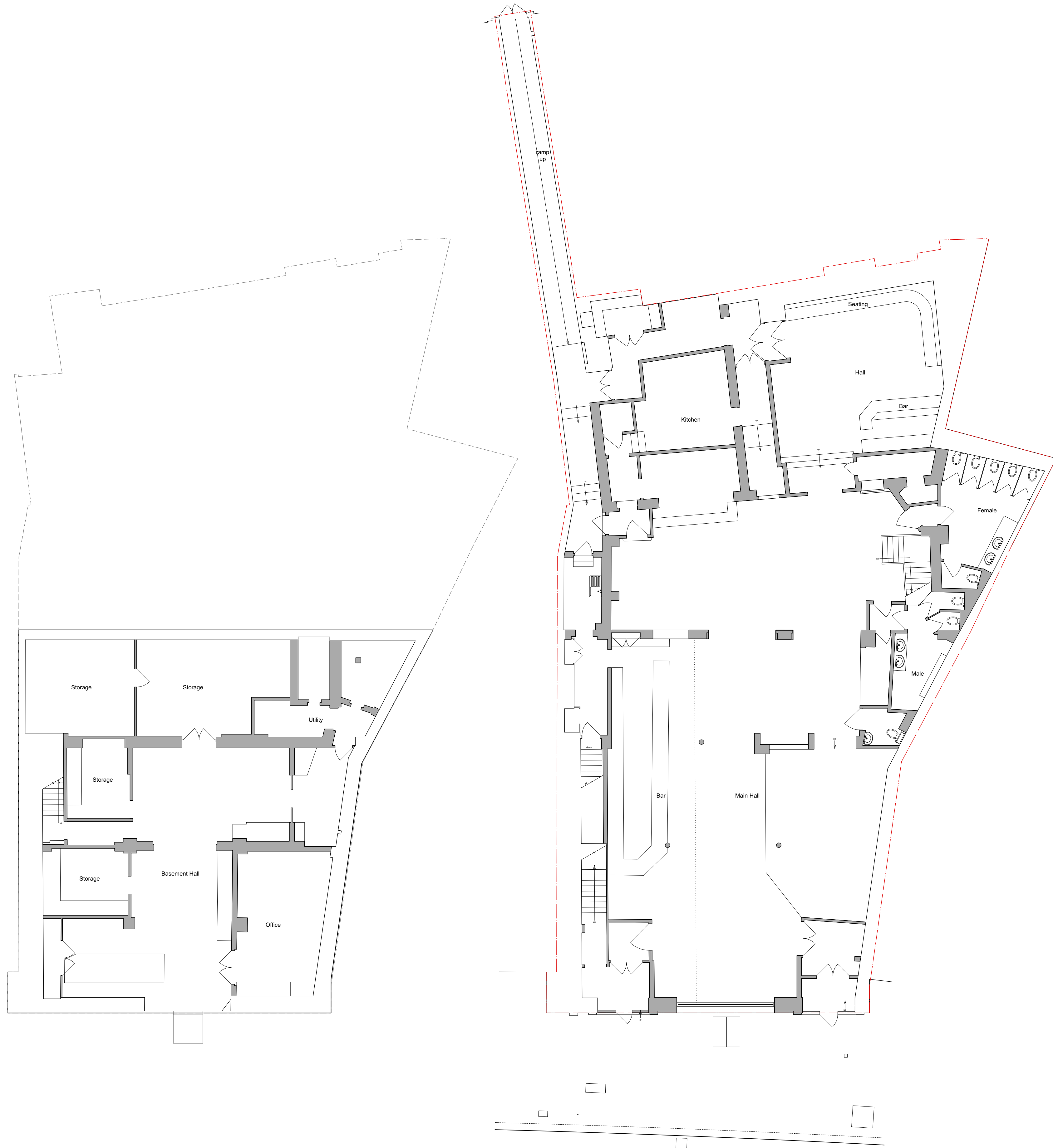
BASEMENT FLOOR PLAN Scale: 1:100