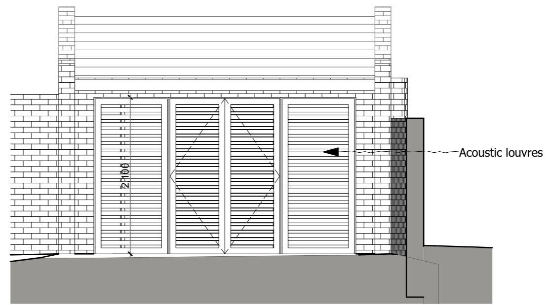
2 SCALE 1:50 @ A3 Condenser Enclosure Southeast Elevation