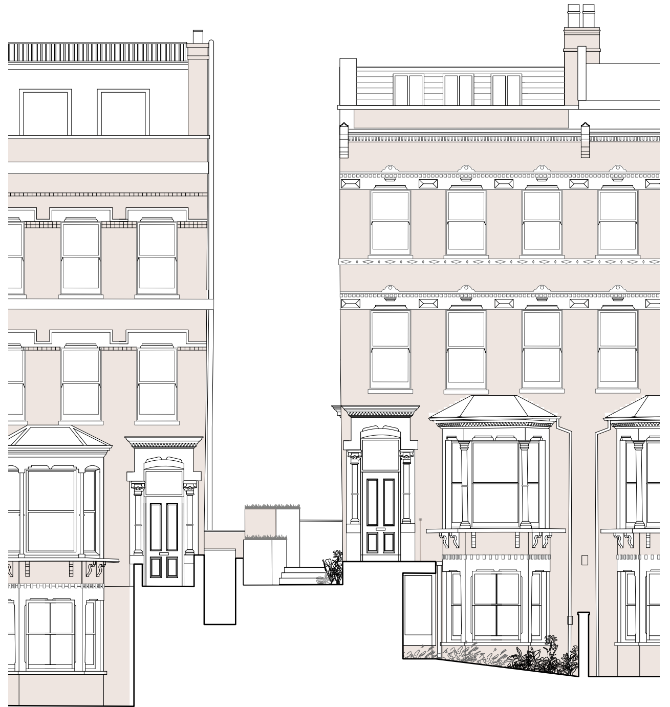
South Hill Park Road Elevation from front garden