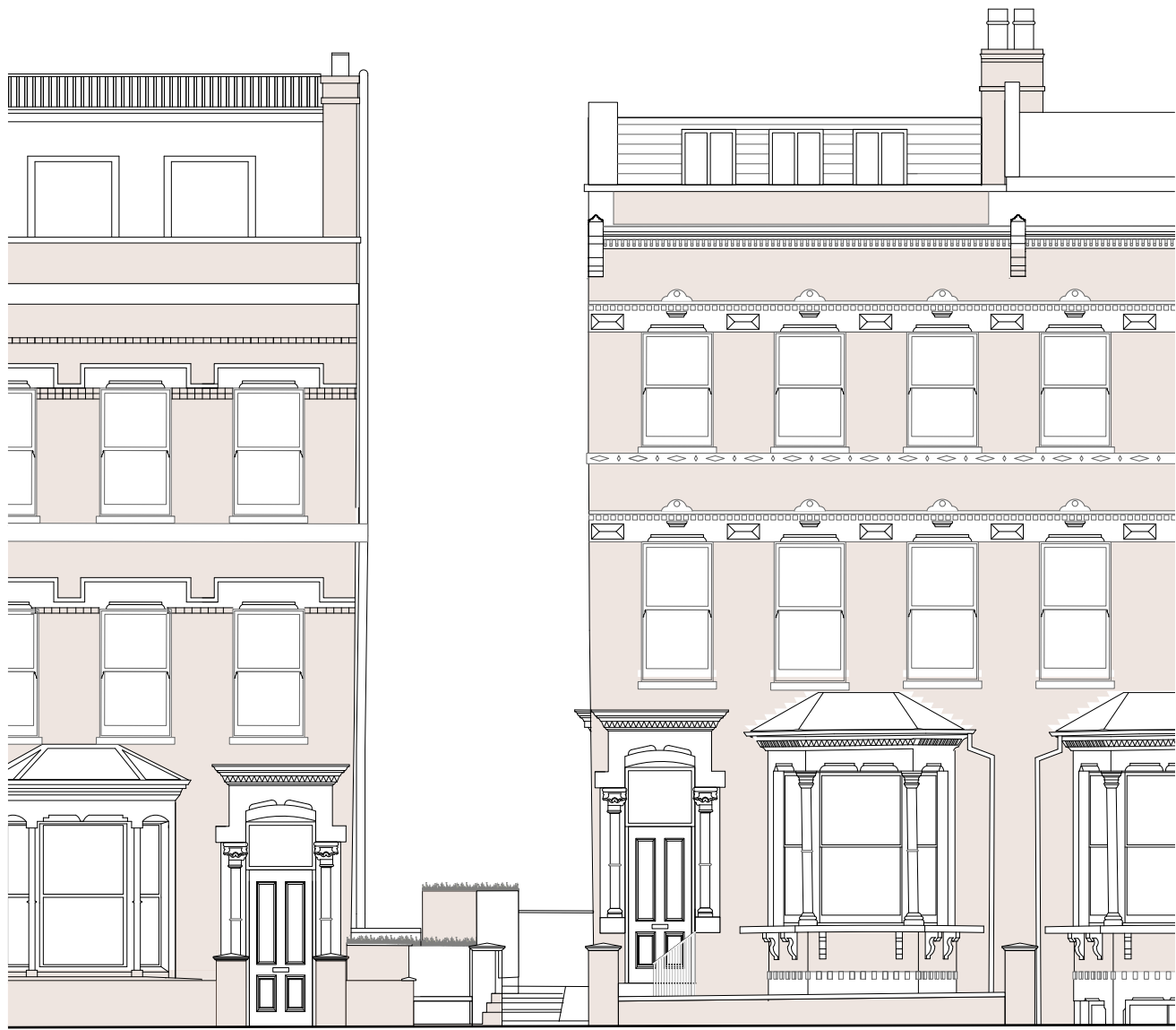
South Hill Park Road Elevation from pavement