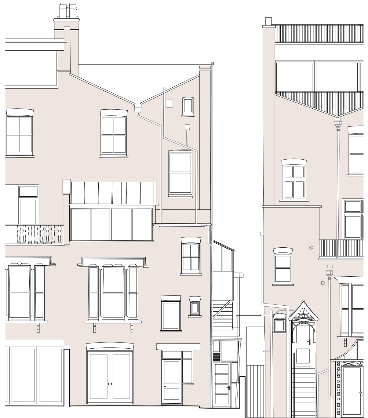
Existing Garden Elevation