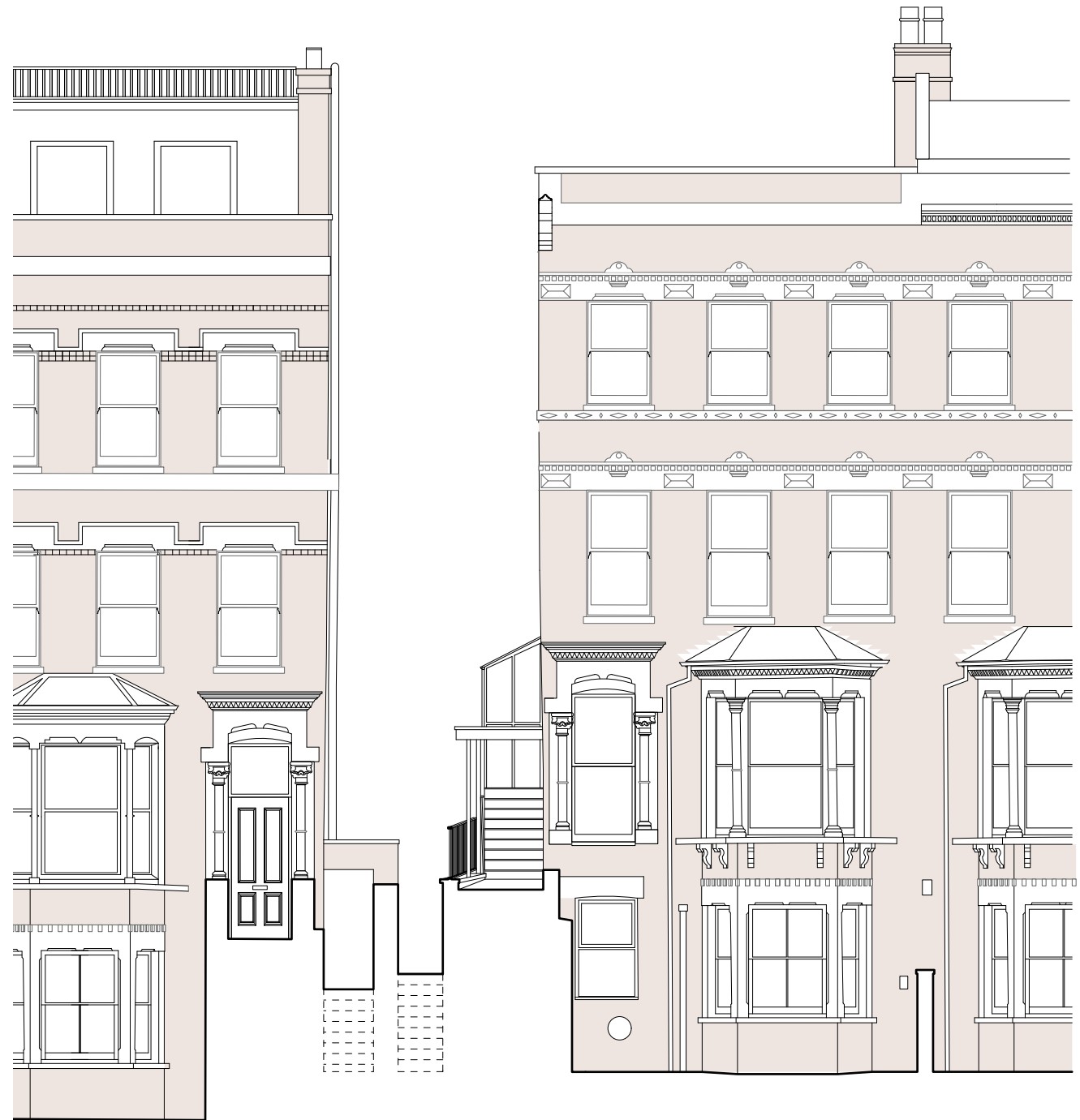
South Hill Park Road Elevation (Showing Lower Ground Bay Window)