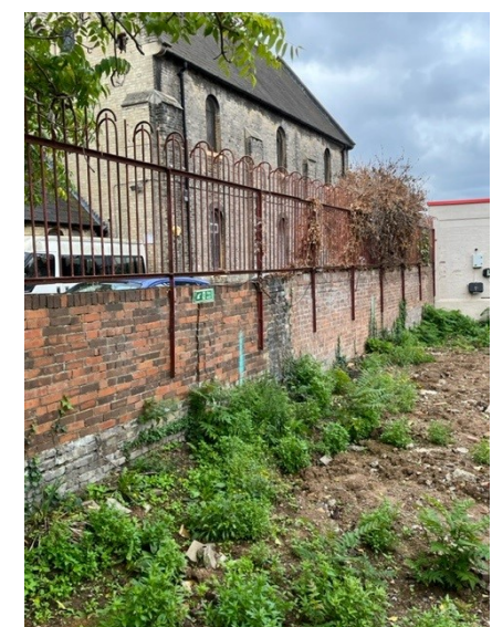
2. Existing Boundary Wall. View from 19-37 Highgate Road