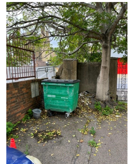
1. Existing Boundary Wall. Builders' stone will be retained and re-instated in the new wall