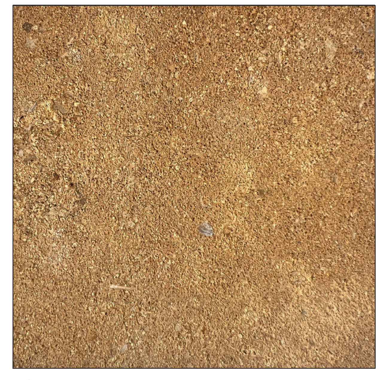
6 LIMESTONE Specification: Guiting stone - to match existing retained & restored stone