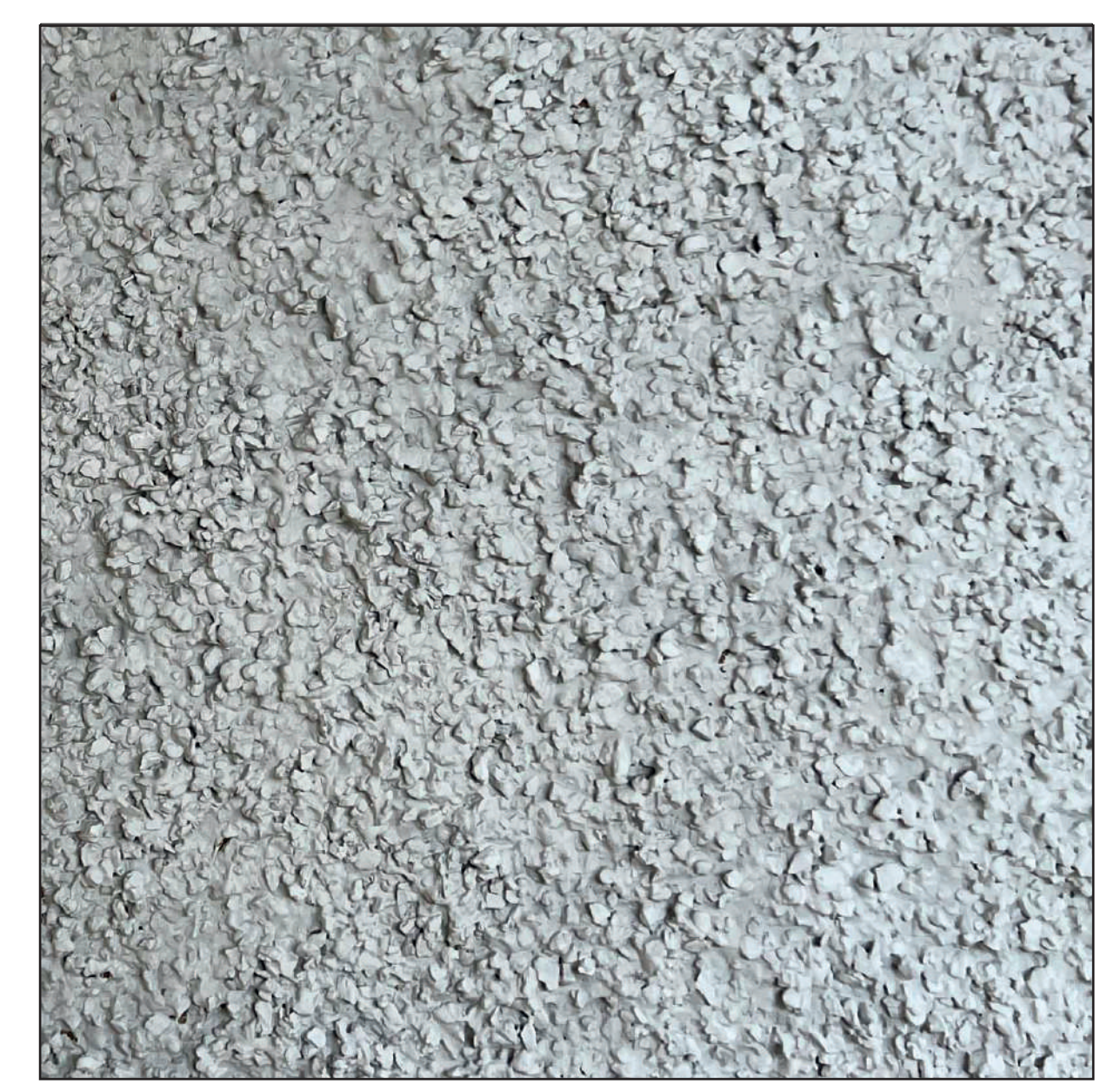
5 TRADITIONAL ROUGHCAST Specification: Lime mortar mix