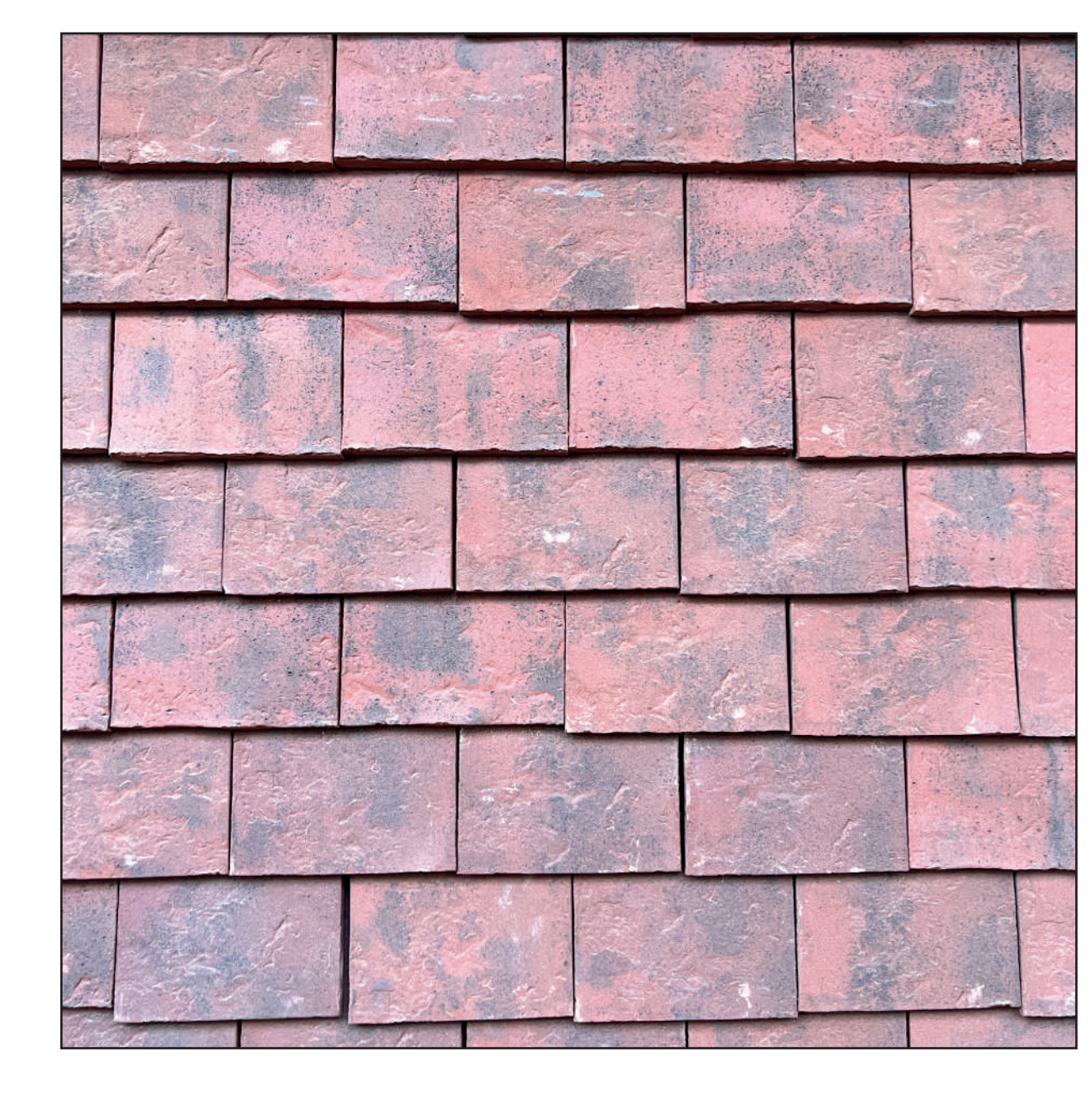
CLAY ROOF TILES Tile specification: Redland Rosemary Craftsman Plain Roof Tile - Albury Sanded