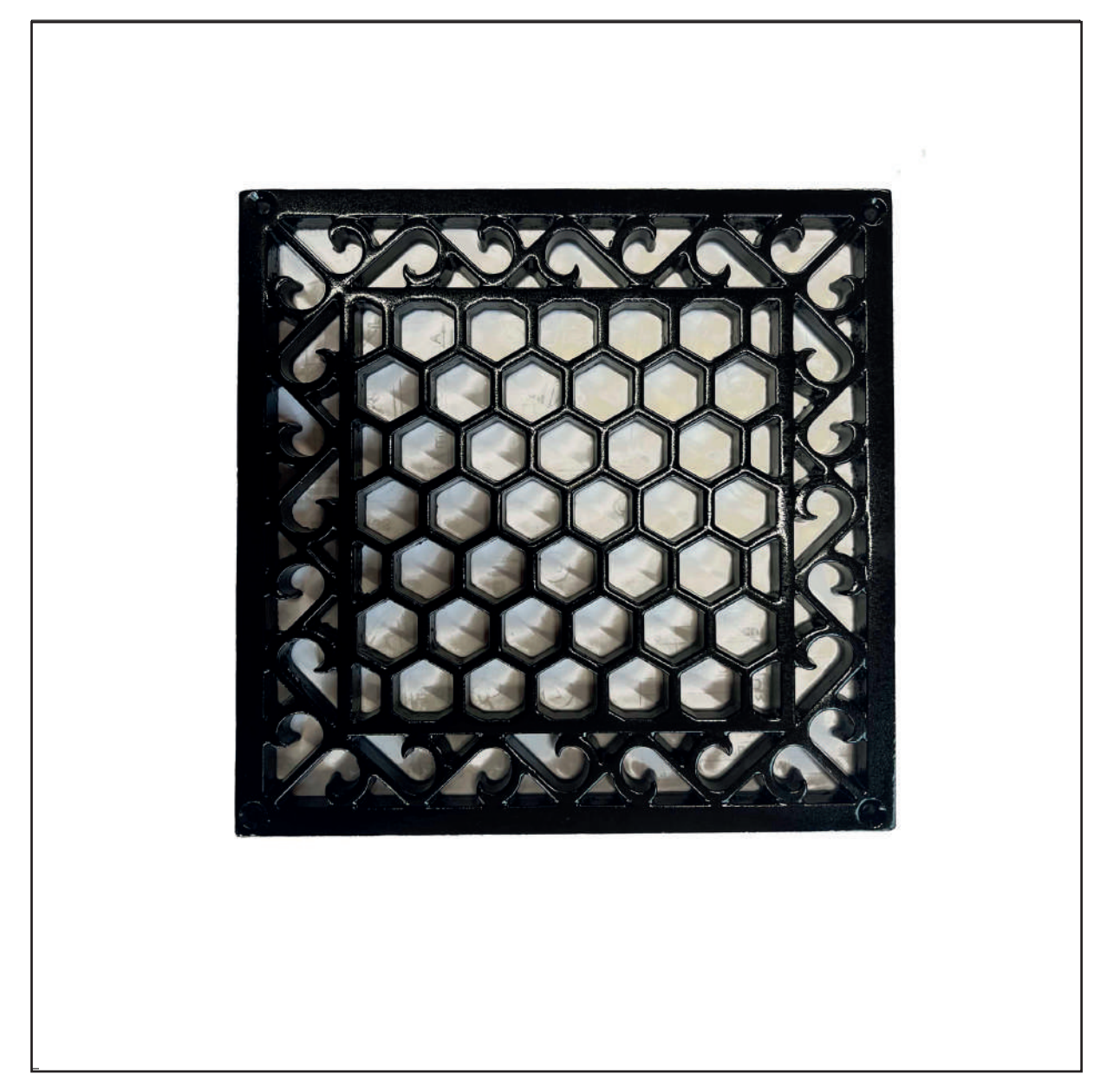
7 GRILLE Specification: Westminster, Heritage and square slotted cast-iron grilles