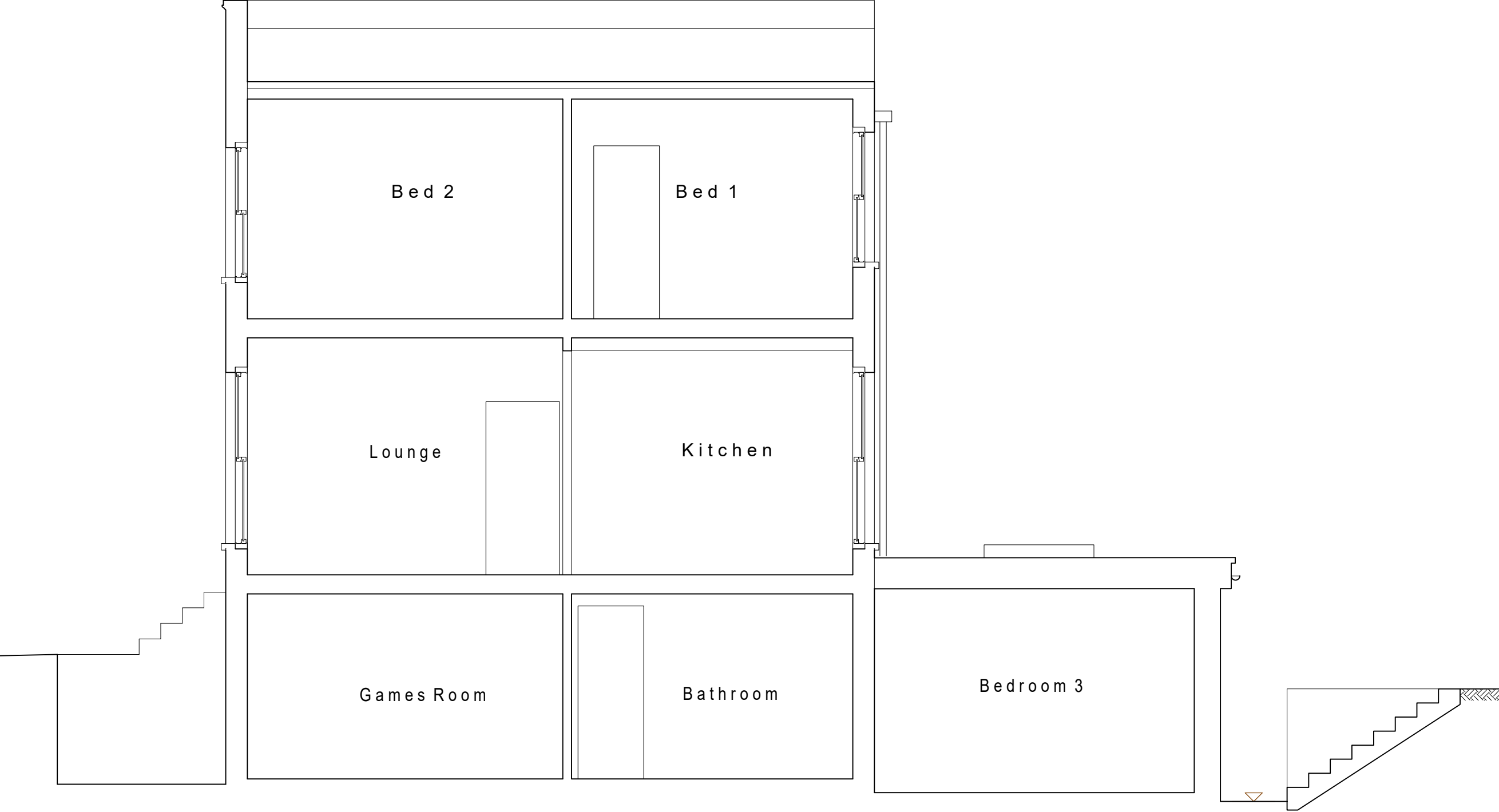
1 EXISTING SECTION A-A 1 : 50

USE FIGURED DIMENSIONS ONLY. ALL DIMENSIONS MUJST BE CHECKED ON SITE & ANY INCONSISTENCIES MUST BE REPORTED BACK TO THE ARCHITECT. THIS DRAWING AND ANY DESIGNS INDICATED THEREON ARE THE COPYRIGHT OF THE ARCHITECT. ALL RIGHTS ARE RESERVED. NO PART OF THIS WORK MAY BE REPRODUCED WITHOUT PRIOR PERMISSION IN WRITING FROM THE ARCHITECT.