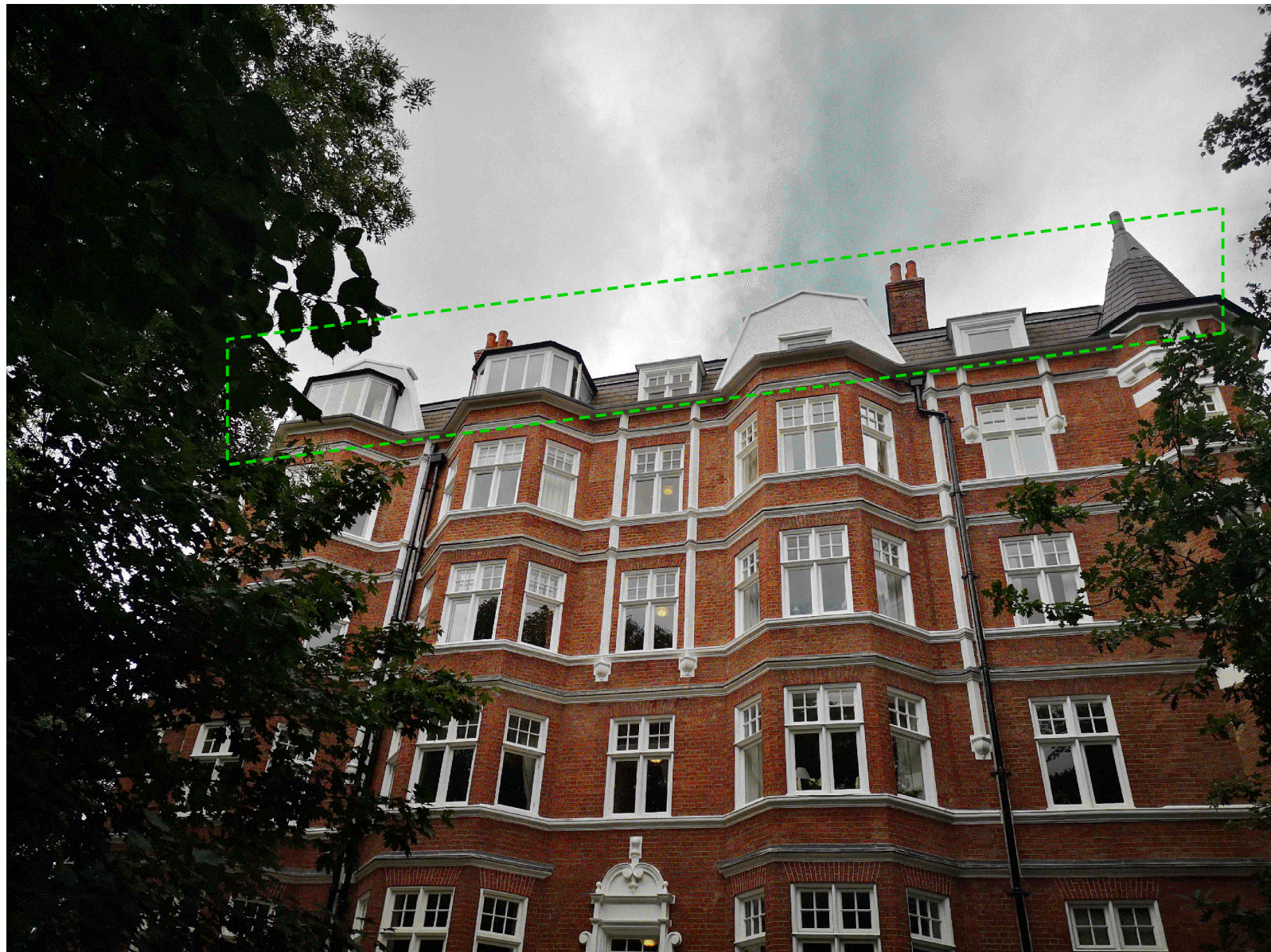
03 Existing North-East Facade Photographs