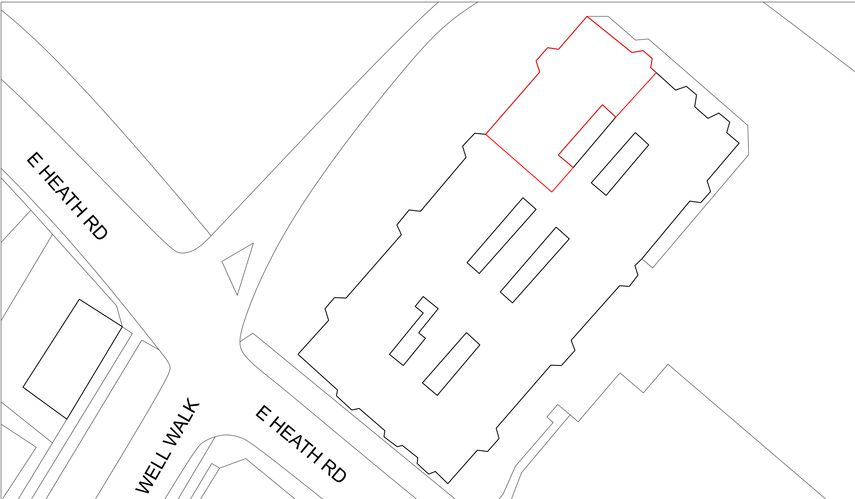
02 Site Plan Scale 1:250 @A1